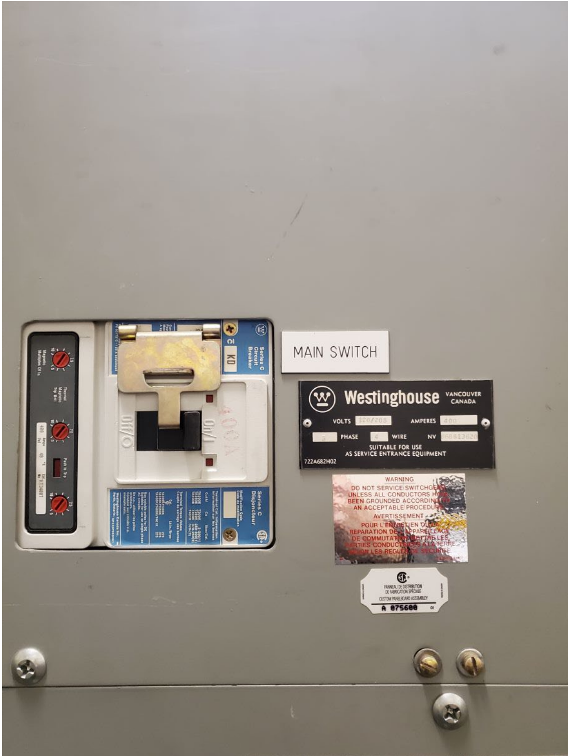
Electrical Main Panel