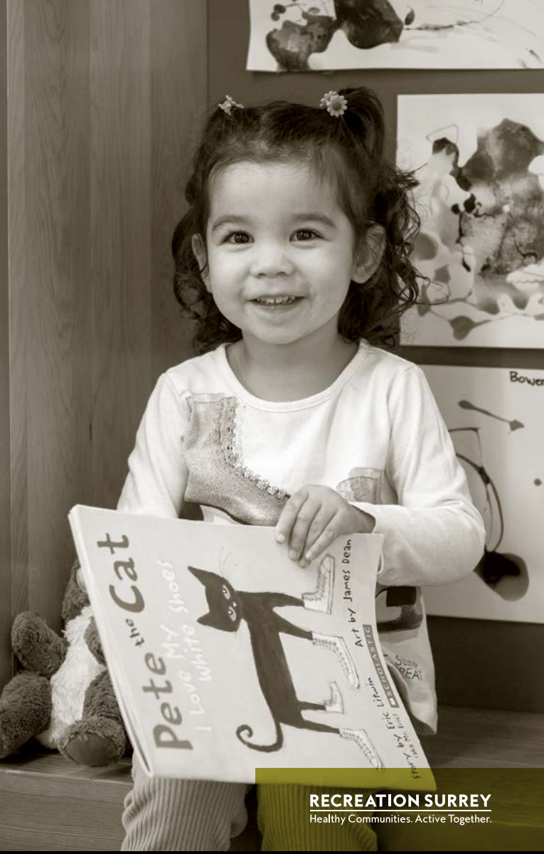
RECREATION SURREY Healthy Communities. Active Together.