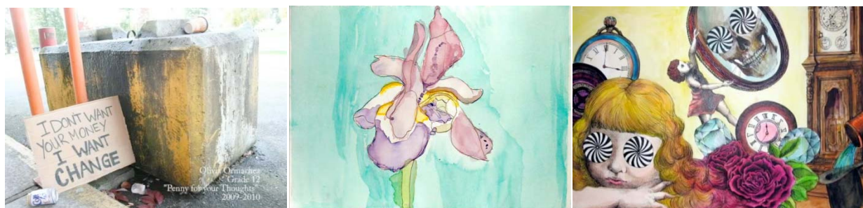
Screen captures from the presentations by Lord Tweedsmuir, Princess Margaret, and Elgin Park (left to right)

The student projects reveal a spectrum of subject matter. In addition to the portrayal of scenes of everyday life at home and school, from family dynamics to the trials and tribulations of dating, the art also presents the students’ interest in societal issues such as animal abuse, the effects of urban development, the ongoing problem of drinking and driving, and the impacts of climate change on the environment.