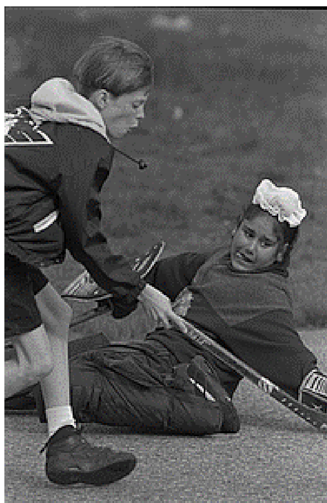
Street hockey. 1996.