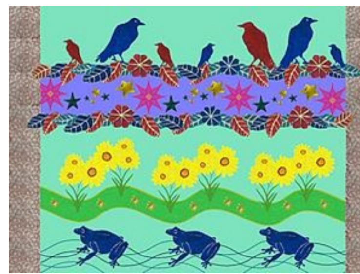
Clayton Futures Panel. Created with children and youth from the Clayton community, using potato prints and linocuts.