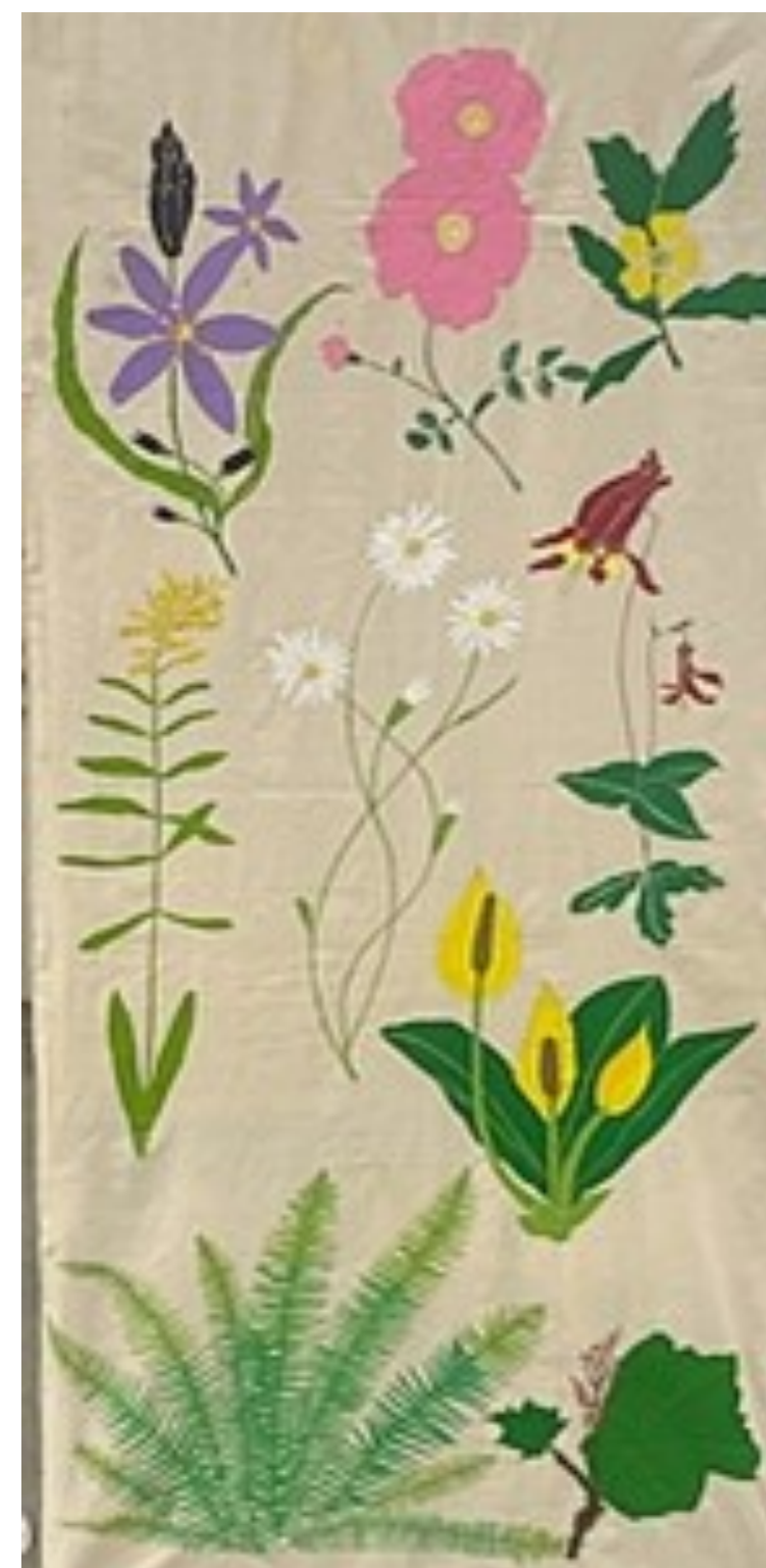
Community Mural. A fabric mural painted with Clayton community members of different ages. Featuring native plants.