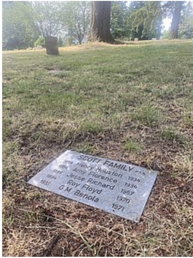
Grave marker for the Scott family in Surrey Centre Cemetery. They were one of the earliest Black families to settle in Surrey (Cloverdale) in 1912.