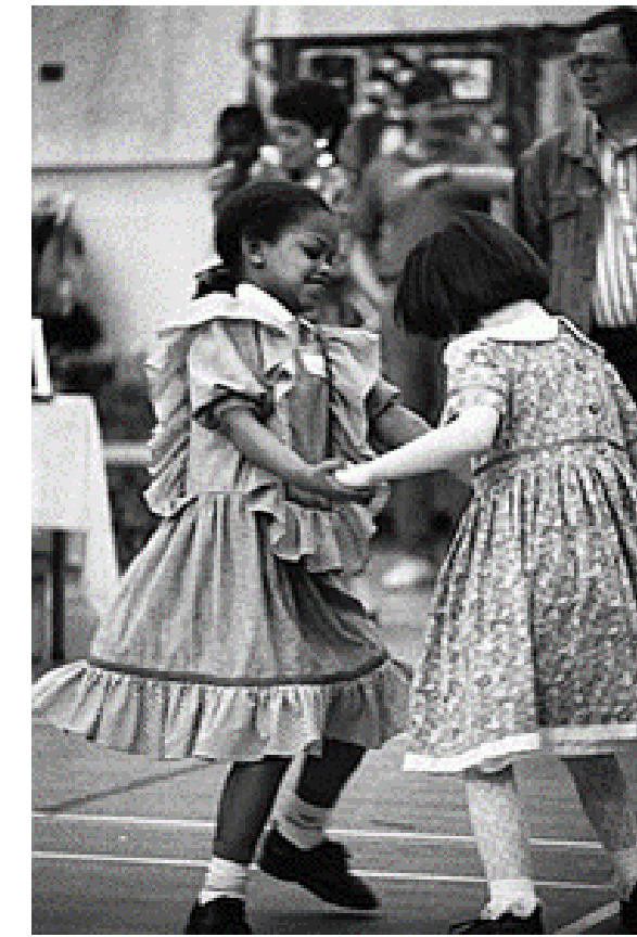
Rainbow Marketplace/ Afro-Caribbean event. 1995.