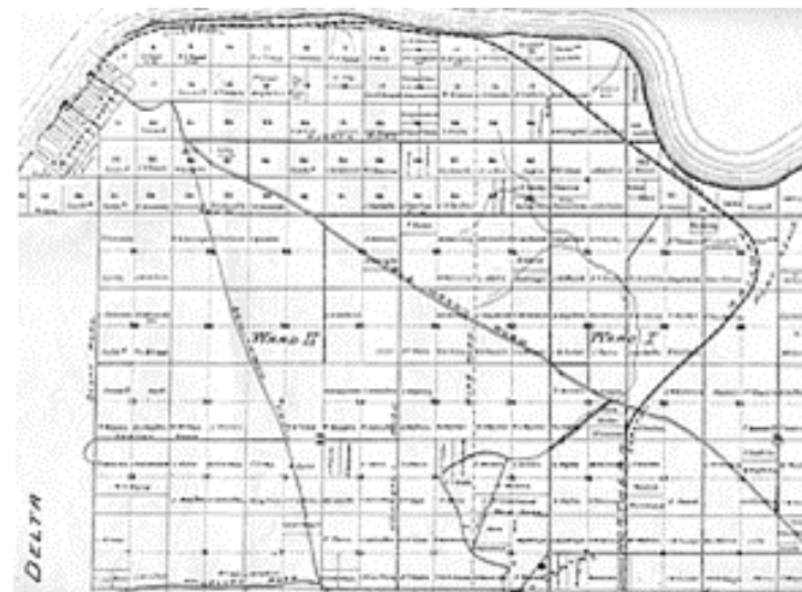
Pre-emption Map. Showing Surrey and the Clayton area in the past. 1897.