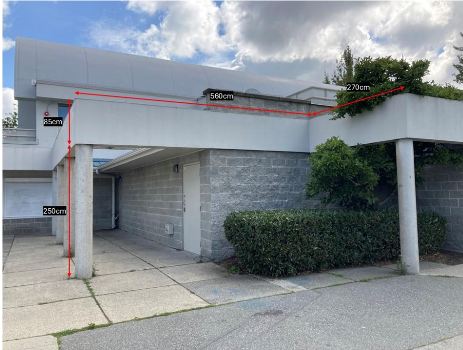
North Façade continued