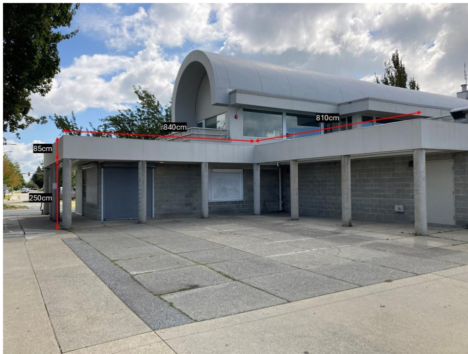
North Façade continued