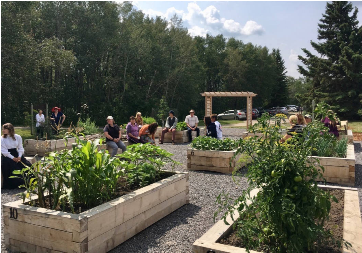
Location: 555 Knight Road Chilliwack, BC