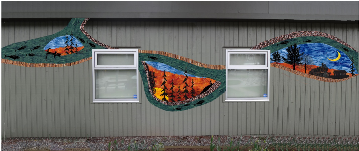
Approximate location of proposed artwork