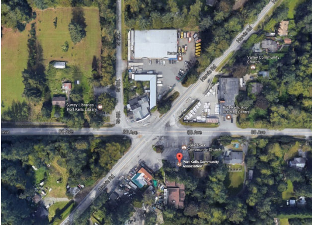
Aerial view of Port Kells Hall and surroundings