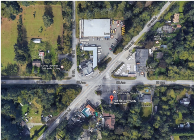
Aerial view of Port Kells Hall and surroundings