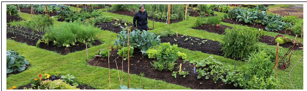
Image from the 2016 growing season of the PLOT Sharing Garden