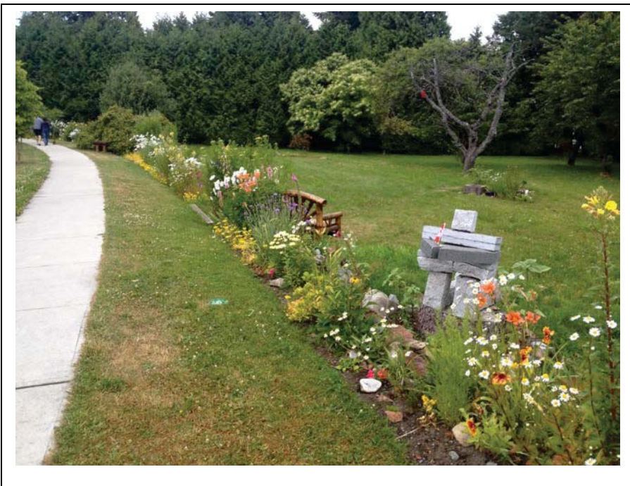
This image shows the planted border along 156 St. The border was created over 7 years with the residents growing hundreds of annuals and perennials from seed.