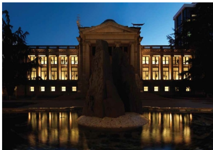
"Window Display" by Erica Stocking. Site Specific Artwork for group exhibition "How Soon is Now" at Vancouver Art Gallery in 2009

My research is one of expansion and contraction: following tangents picked up in conversation, spending time on site, understanding what the district energy plant is and how it is functioning, combining, editing and fleshing out these areas. Through this, clarity in understanding the opportunities for integration of art into the park will emerge.