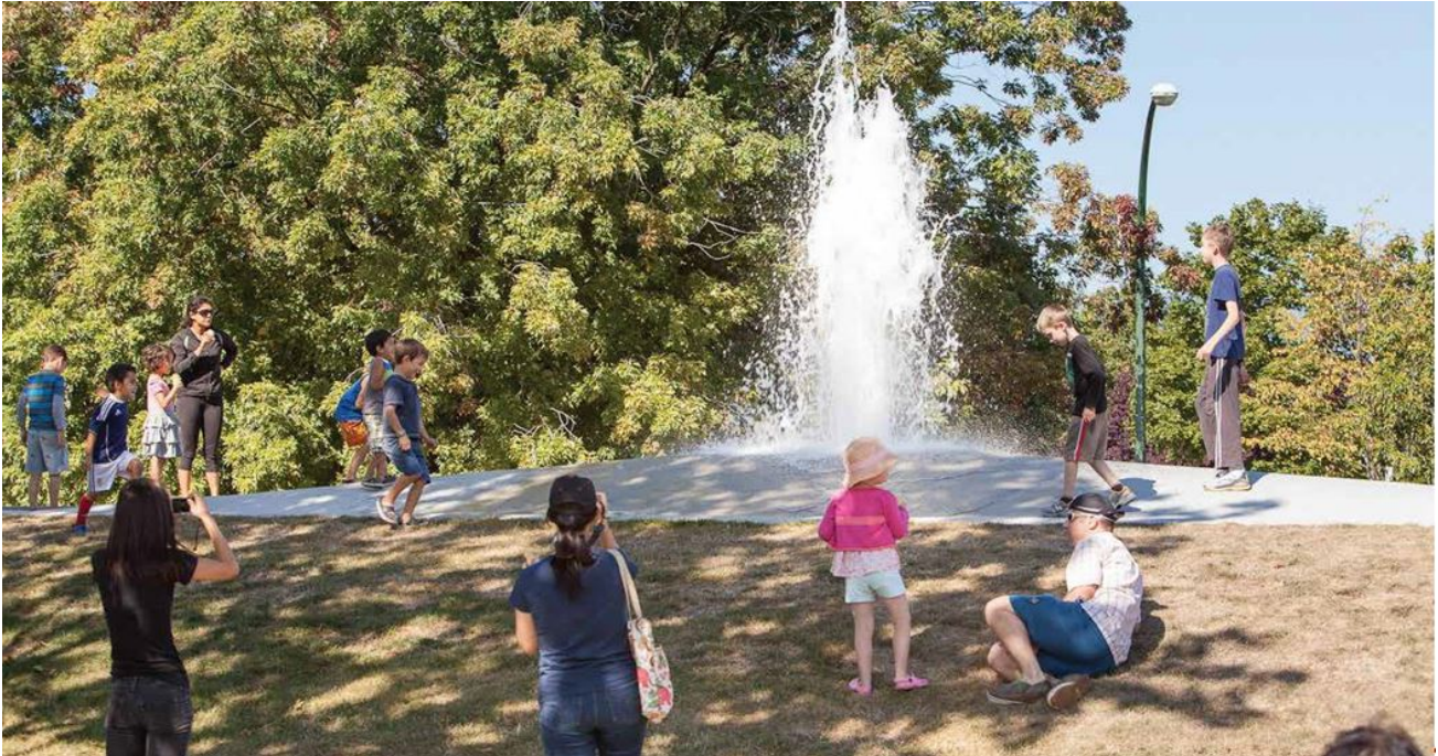
“Geyser” for Hillcrest Park, by Erica Stocking and Vanessa Kwan, Completion 2012. Commissioned by The City of Vancouver Public Art Program $278,000 budget

“Geyser” was generated in response to the local oral histories of water in the neighbourhood, the interplay between civic and neighbourhood spaces and the green initiatives of the building. The “geyser” is connected to the greywater system in the building, and only “erupts” when there is a demand for potable water in the system during the dry summer months. In this way the civic fountain becomes a natural geyser making visible one element of the community’s water usage.