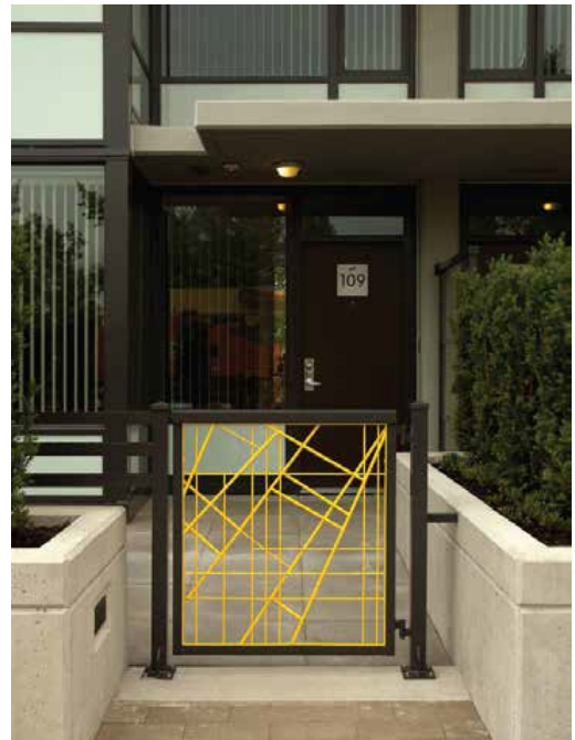
“Yellow Fence” by Erica Stocking, Site Specific artwork for the HUB building at UniverCity, SFU Burnaby in 2009. $55,000 budget

“Yellow Fence” consists of 15 powder coated stainless steel gates. It articulates the space between public and private. A yellow construction fence enclosed the HUB building during construction; it was the first definition of access between public and private space on the site. The artwork is a sequence derived from this original construction fence.