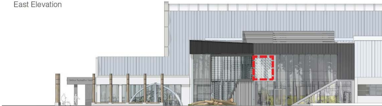
Architectural rendering of the location of the public art on the south and east glazing, Newton Recreation Centre