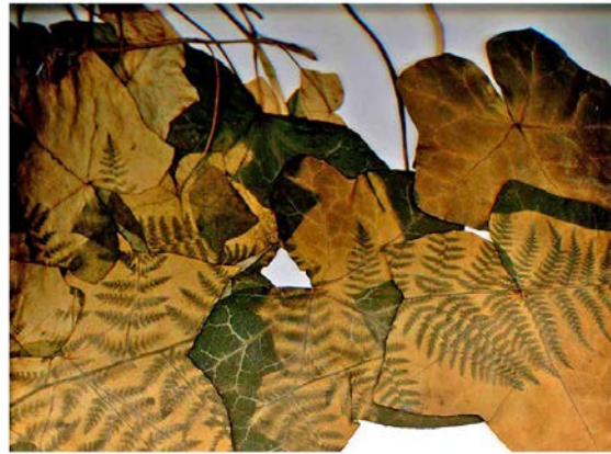
Cellular, 2015, 50x12 inches, ultraviolet photograph of lady fern on English ivy digitally scanned and printed with inkjet on paper

incorporating these motifs into the community architecture of Newton. I think there could also be some interesting resonance with the “Grove” adjacent to the Recreation Centre.