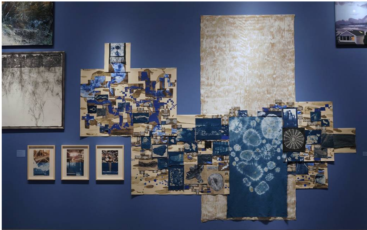
Pressure, Light, Oxygen: Glenrose Cannery (installation at Surrey Art Gallery), 2015, 14 x 10.5 feet, acrylic, clay, crushed seashell, cyanotype, and indigo, on cotton and linen

I enjoy making art for a gallery environment, but I am particularly