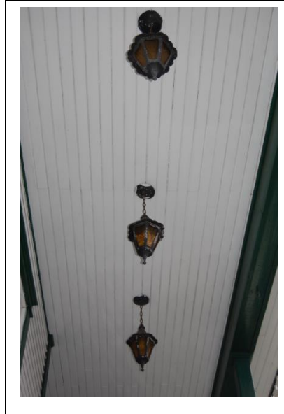
Replacement of exterior light fixtures