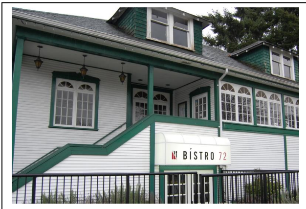
Repainting of building exterior