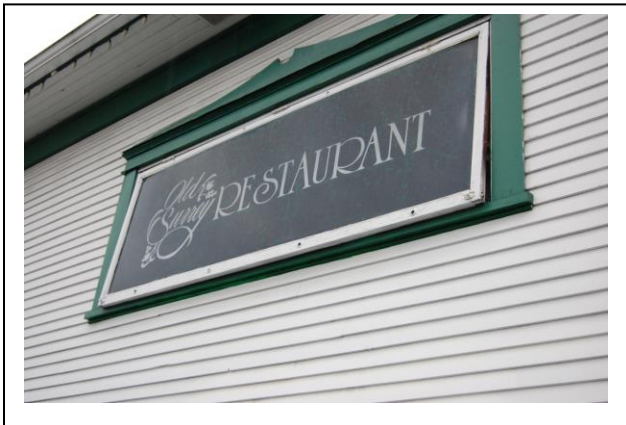
Repair of the building sign