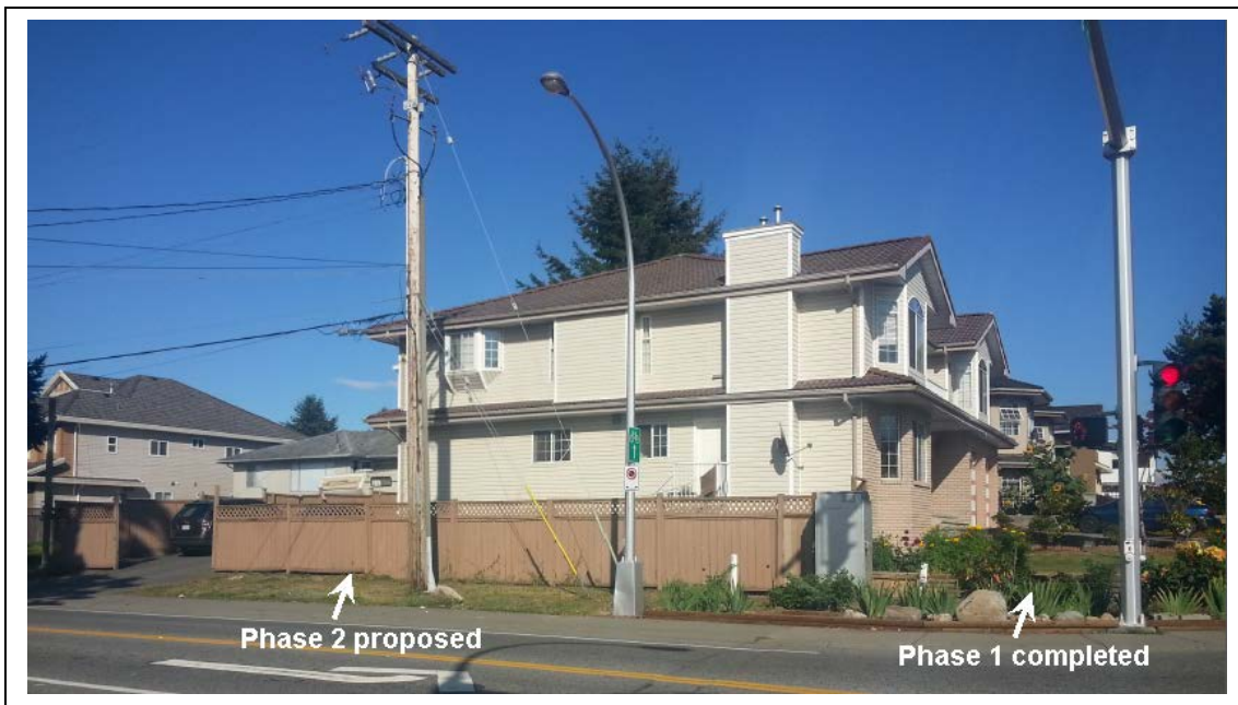
Photo of proposed phase 2 boulevard planting along 124 th Street.