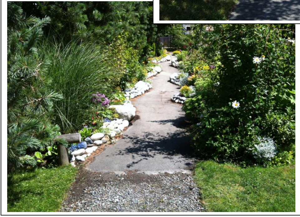
Photo of pathway locations for proposed trellis gateways.