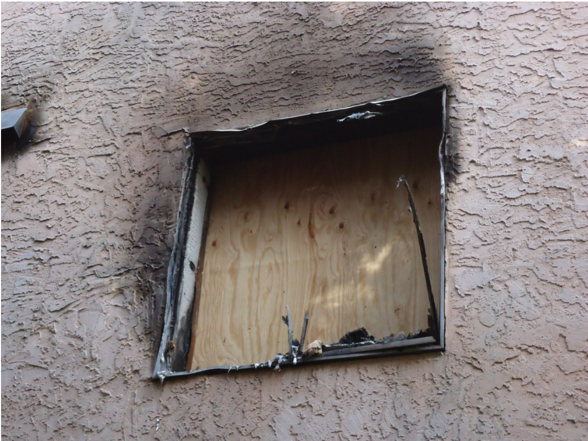
Photograph taken March 4, 2013