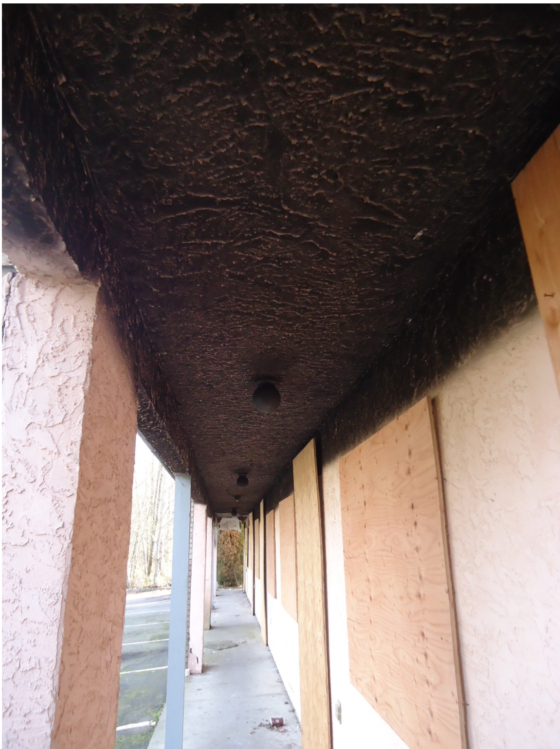
Photograph taken March 4, 2013