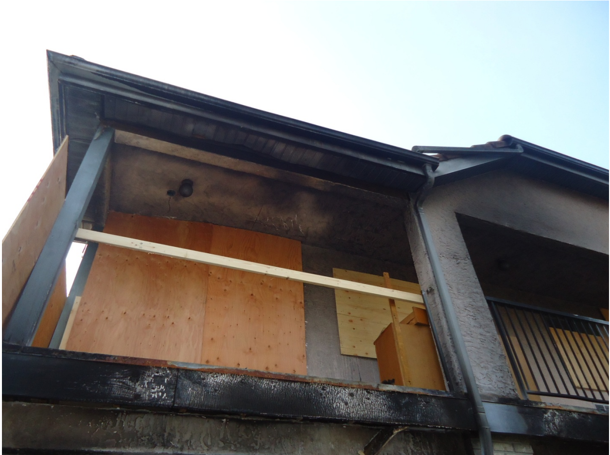
Photograph taken March 4, 2013