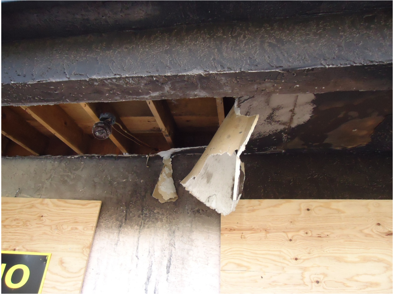
Photograph taken March 4, 2013