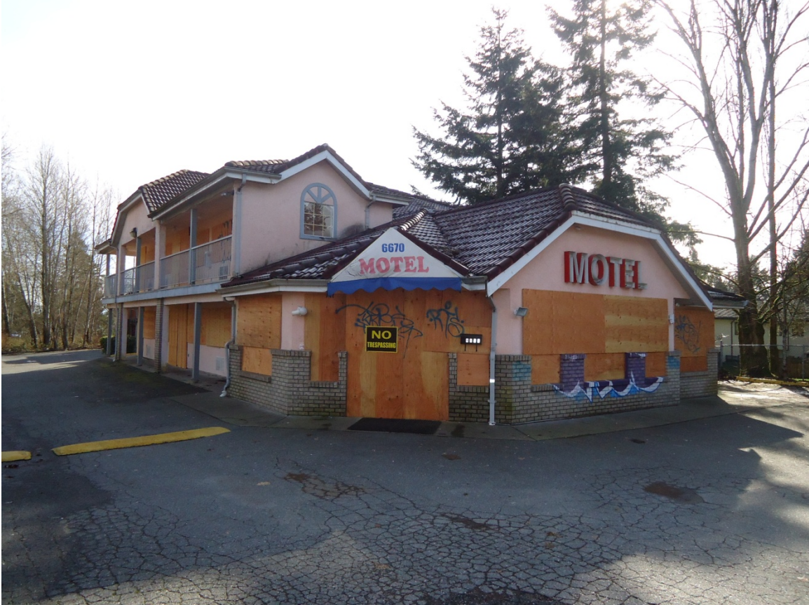
Photograph taken March 4, 2013