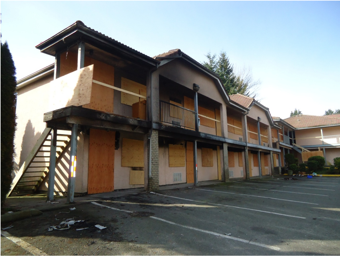
Photograph taken March 4, 2013