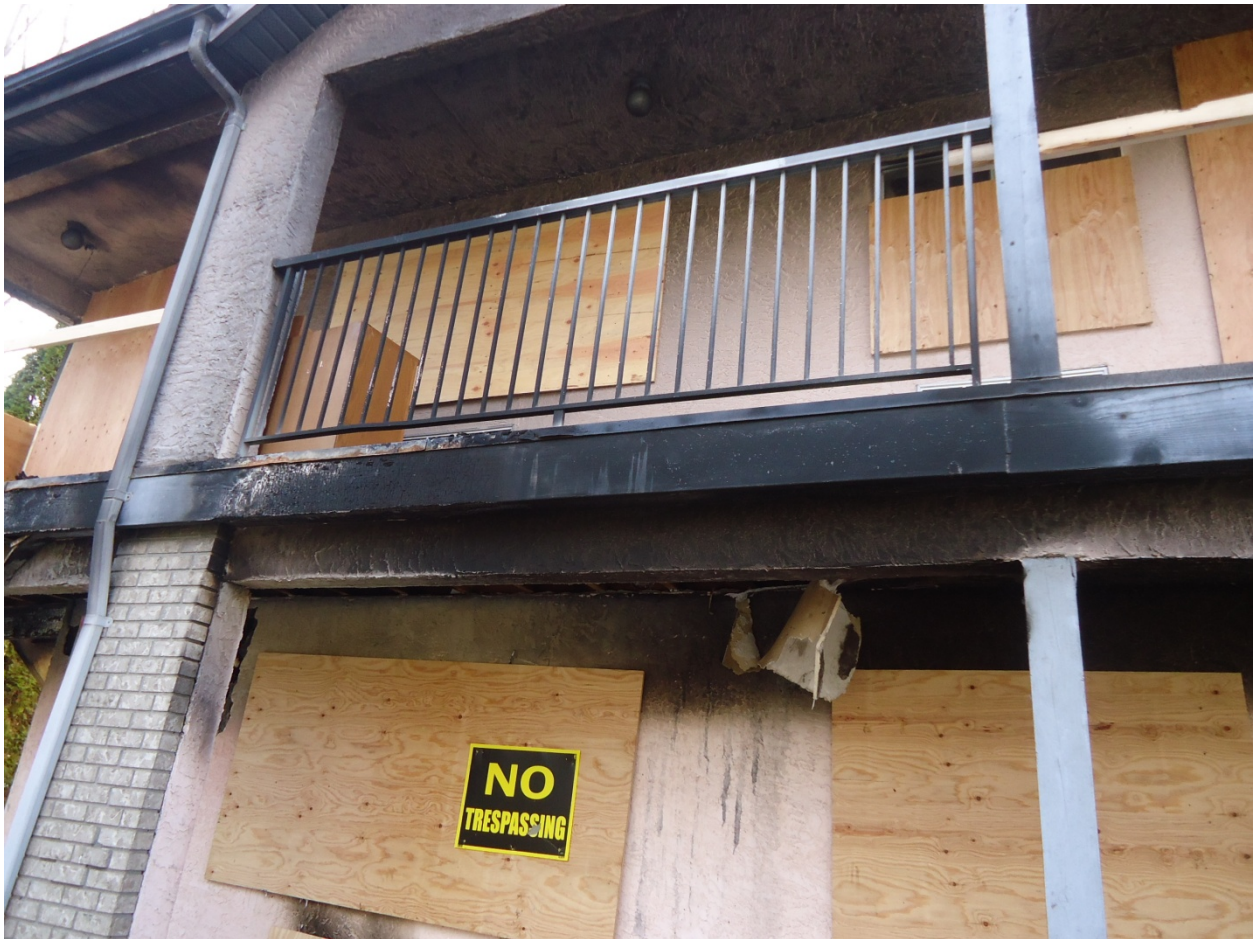
Photograph taken March 4, 2013