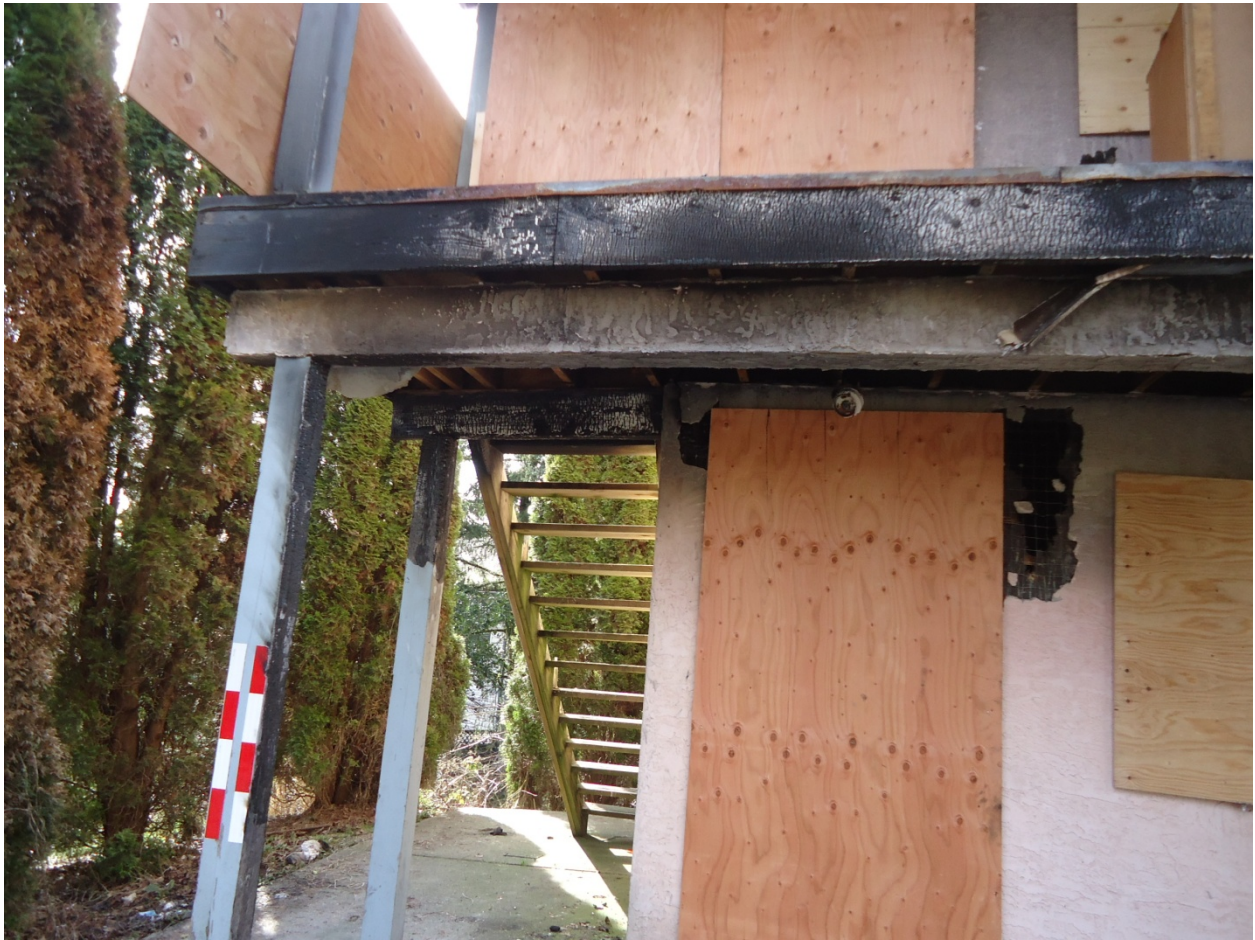
Photograph taken March 4, 2013