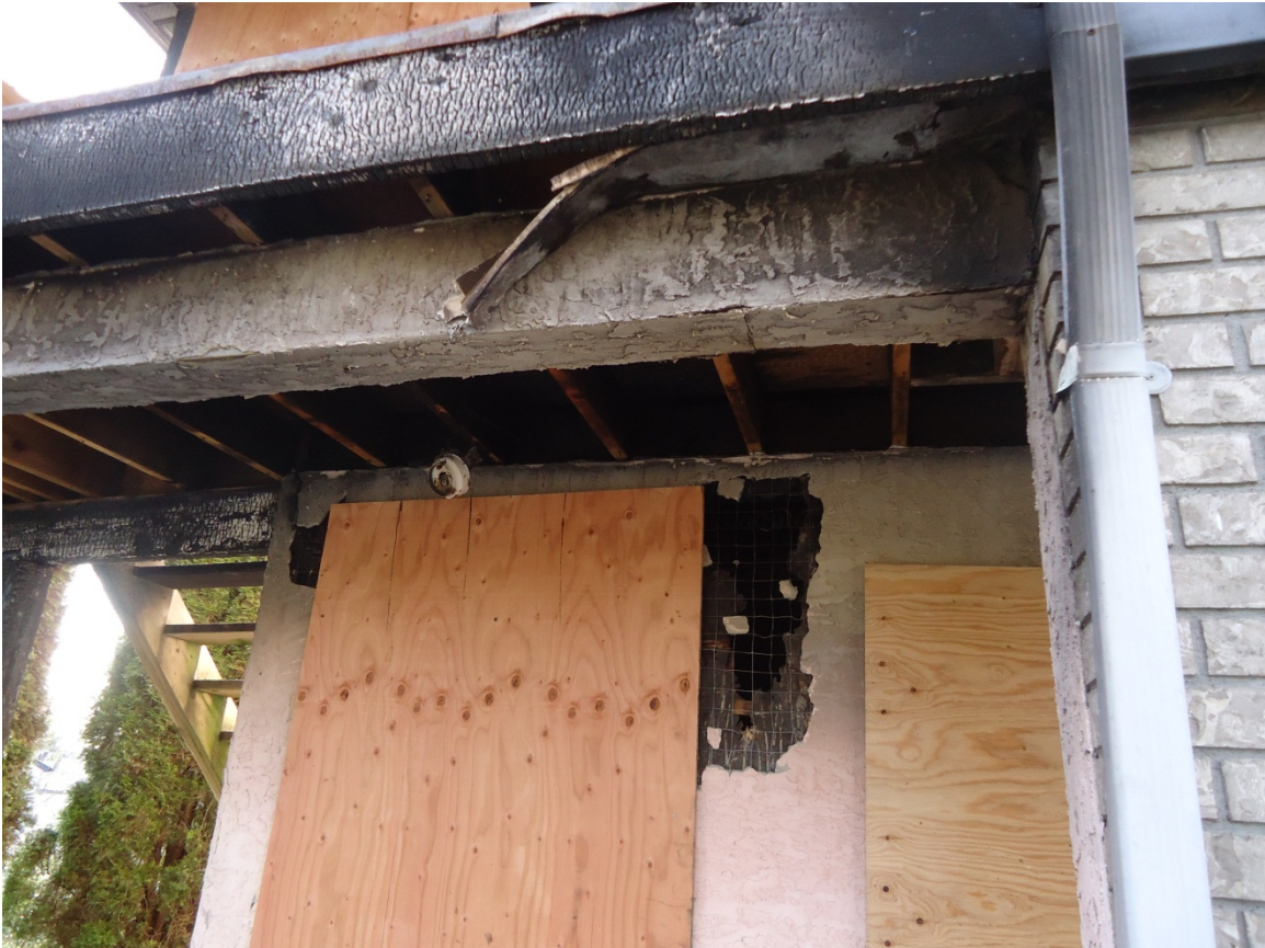
Photograph taken March 4, 2013