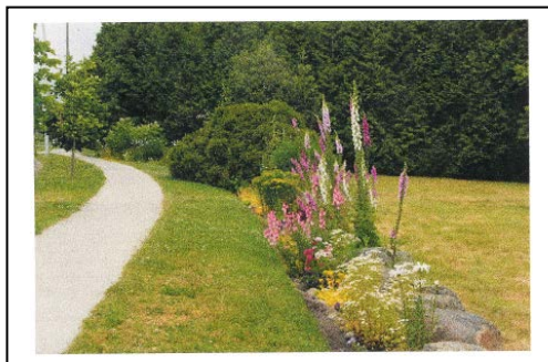
Proposed boulevard planting