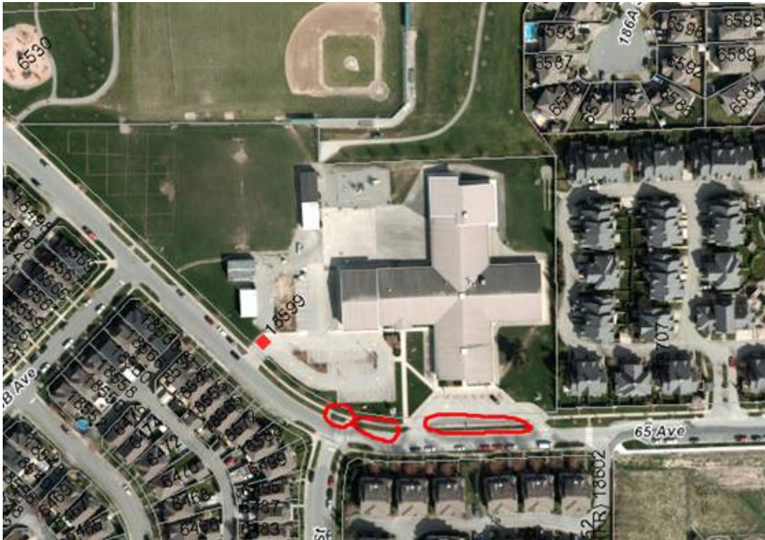
Location of Boulevard Planting in front of Hillcrest Elementary School 18699-65 Ave.