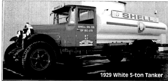
1929 White 5-ton Tanker

The Surrey Heritage Society had approached the Cloverdale Rodeo & Exhibition as a potential site for the Heritage Truck collection with the belief that a lot of synergy in attracting visitors could be mutually achieved. Initially the Society was interested in using the Alice MacKay Building which had enough square footage to easily house the entire collection. Since the Society was unable to guarantee lost annual revenue that the facility currently achieves, it was decided that old Surrey Museum site be considered as a temporary location. On November 28, 2011, a delegation from the Surrey Heritage Society approached the City of Surrey – Mayor and Council to ask for access to the former Museum site located on the S.W. corner of the Cloverdale Fairgrounds. The City of Surrey had thanked the delegation and noted that they will refer the request to staff for further review.