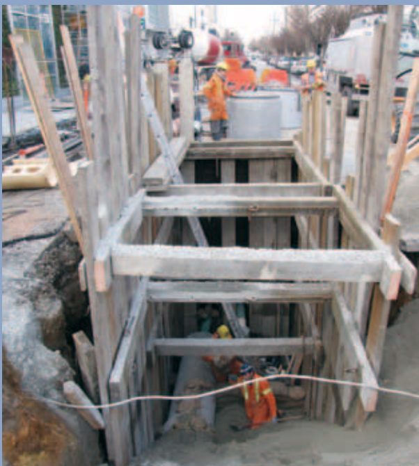
Separating combined sewers is a long-term program.