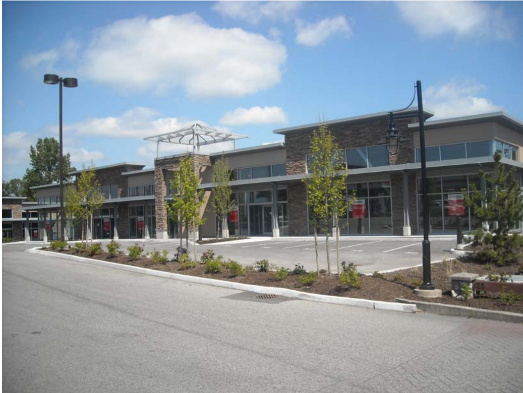
13631 - 80 Avenue