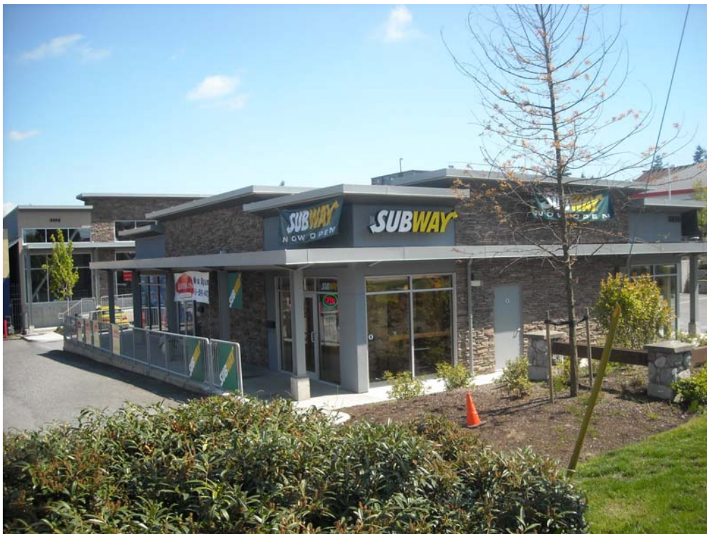
8050 King George Boulevard