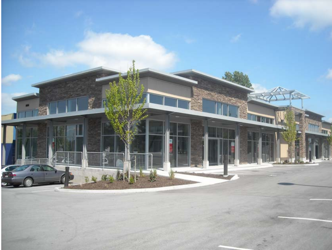
8056 King George Boulevard

v:\wp-docs\building\iodata\apr-june\05131620hh.doc SAW 5/17/10 8:05 AM