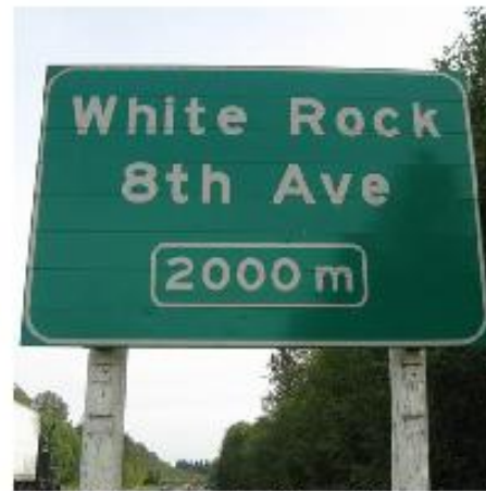
SIGN 5. Hwy 99 Southbound at 18 Ave Add "South Surrey"