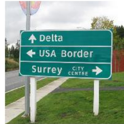
SIGN 15. Hwy 10 Westbound at King George Hwy Add "South Surrey" Add Tourism Sign: "Crescent Beach"