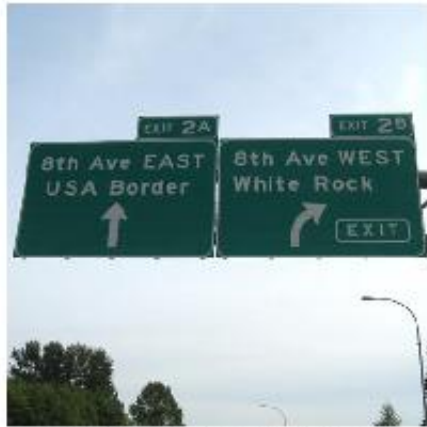
SIGN 7. Hwy 99 Southbound at 12 Ave Add "South Surrey"