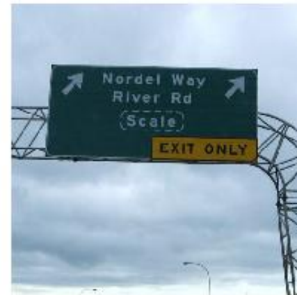
SIGN 12. Hwy 91 Southbound at Nordel Way Add "Surrey City Centre"