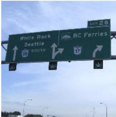
SIGN 1. Hwy 99 Southbound at Hwy 17 Add "South Surrey"