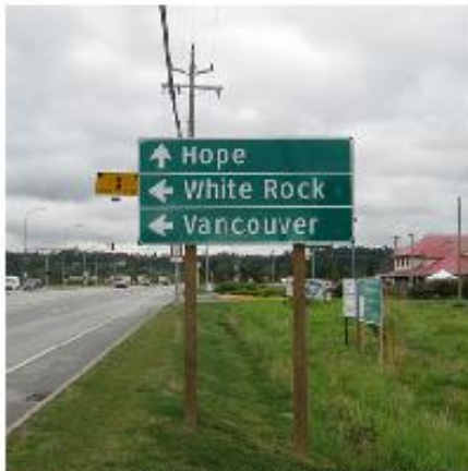
SIGN 16. Hwy 15 Northbound at 8 Ave Add Tourism Sign: "Cloverdale"