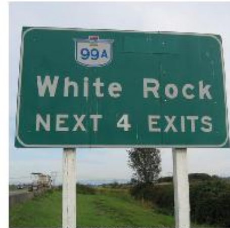
SIGN 3. HWY 99 Southbound at King George Hwy Add "South Surrey"