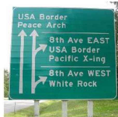
SIGN 6. Hwy 99 Southbound at 17 Ave Add "South Surrey"