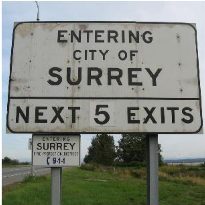
SIGN 19. Hwy 99 Southbound at the Delta Border. Replace Sign.