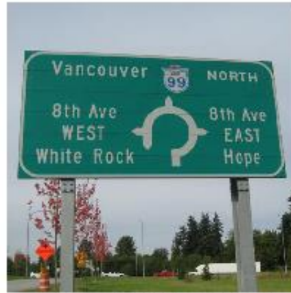
SIGN 8. Hwy 99 Northbound at 8 Ave Add "South Surrey"