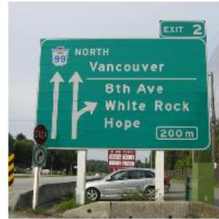
SIGN 9. Hwy 99 Northbound at 2 Ave Add "South Surrey"