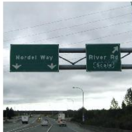
SIGN 11. Hwy 91 Southbound at Nordel Way Add to left sign: "Surrey City Centre"