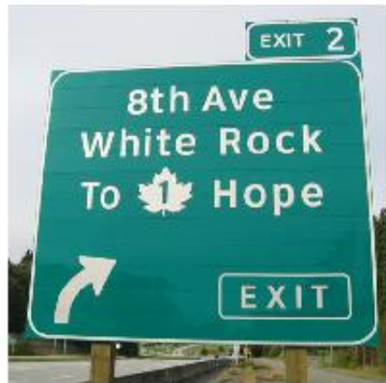
SIGN 10. Hwy 99 Northbound at 2 Ave Add "South Surrey"