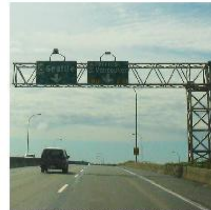
SIGN 18. Hwy 91 Southbound at Hwy 99 Add "South Surrey"