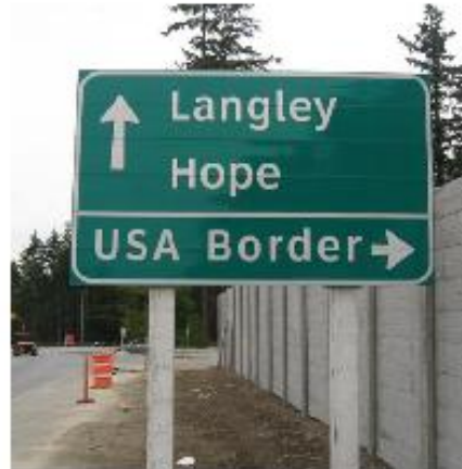
SIGN 14. Hwy 10 Eastbound at KGH Add "South Surrey" & "Surrey City Centre" Add Tourism Sign: "Crescent Beach"