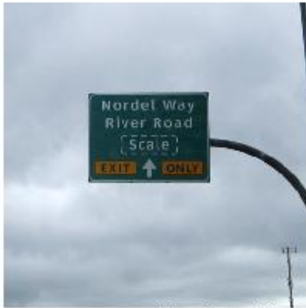
SIGN 13. Hwy 91 Southbound at Nordel Way Add "Surrey City Centre"