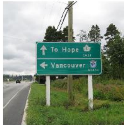
SIGN 17. Hwy 15 Northbound at 8 Ave Add Tourism Sign: "Cloverdale"