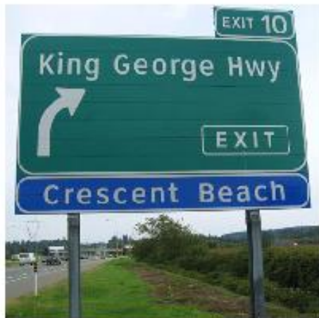
SIGN 4. HWY 99 Southbound at King George Hwy Add "South Surrey"