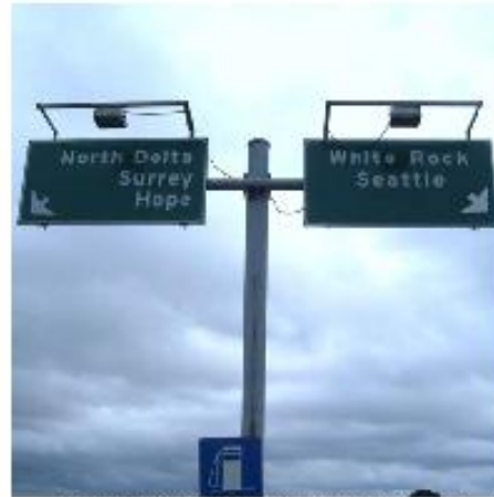
SIGN 2. Hwy 99 Eastbound at Hwy 10 Modify Left sign: Add "North Surrey" Modify Right sign: Add "South Surrey"