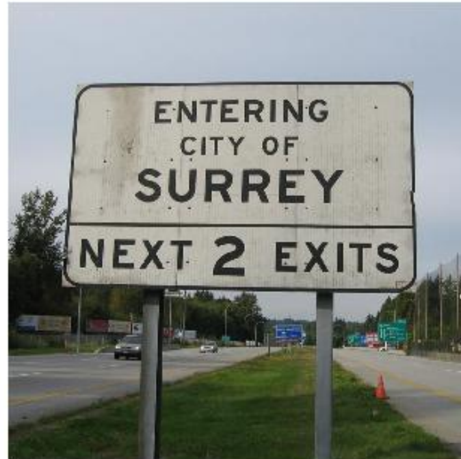
SIGN 20. Hwy 99 Northbound at Peace Arch. Replace Sign.