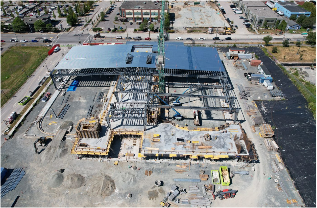
Clverdale Sport & Ice Complex – Aerial Image