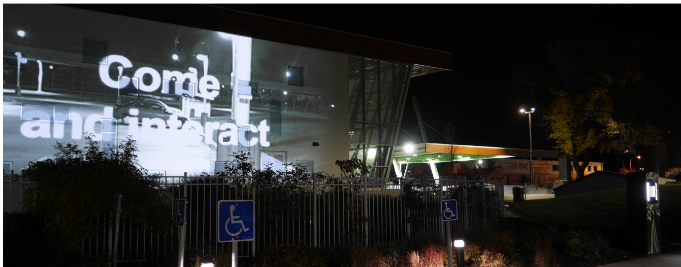
When not in use, the projection encourages participation through messages in both English and French.

Surrey Art Gallery gratefully acknowledges Creative BC, the Province of BC through the BC Arts Council, and French Consulate Vancouver/Consulat général de France à Vancouver for their support of this project.