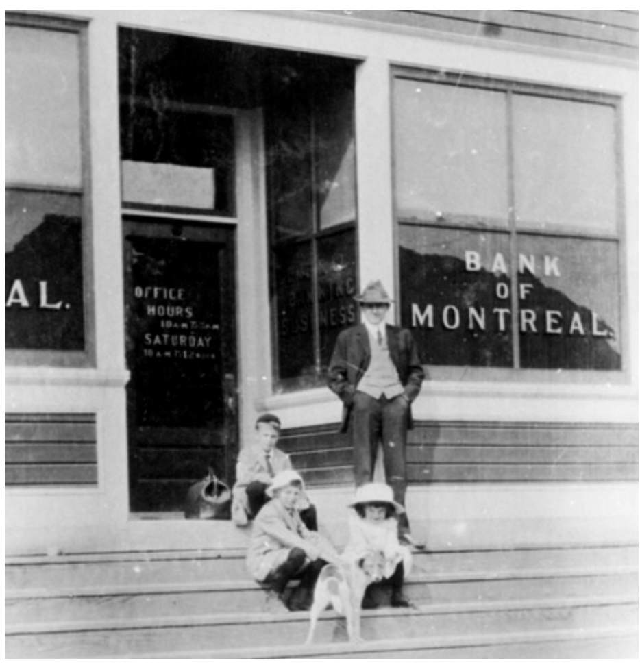
Bank of Montreal, Cloverdale, circa 1910

DONALD LUXTON & ASSOCIATES INC.: DECEMBER 2016