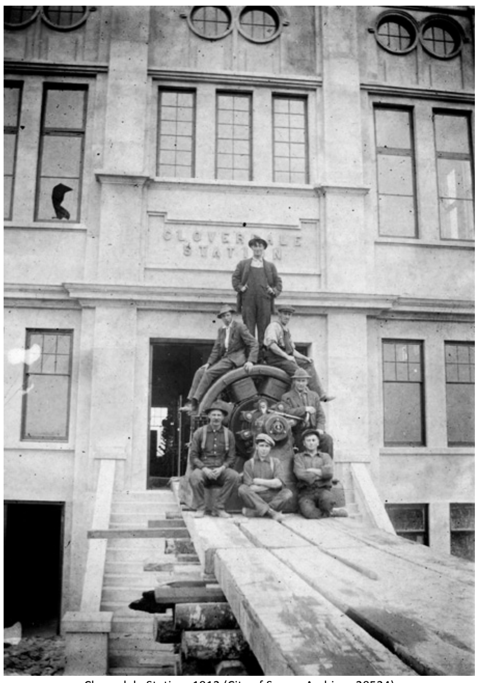
Cloverdale Station, 1912