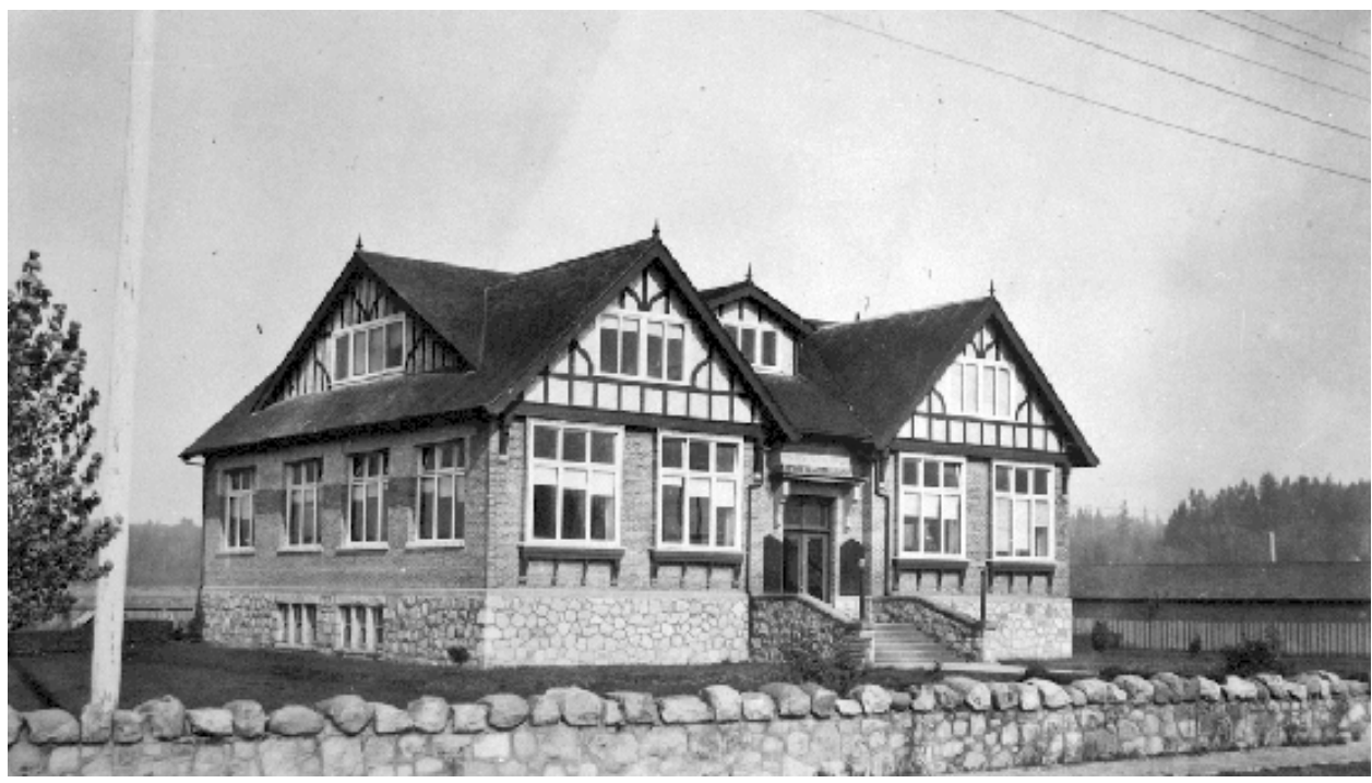
Municipal Hall, 1912

As part of the annual civic budget process, identify budgets for the implementation of Conservation Plans for each site, as well as ongoing maintenance budgets.