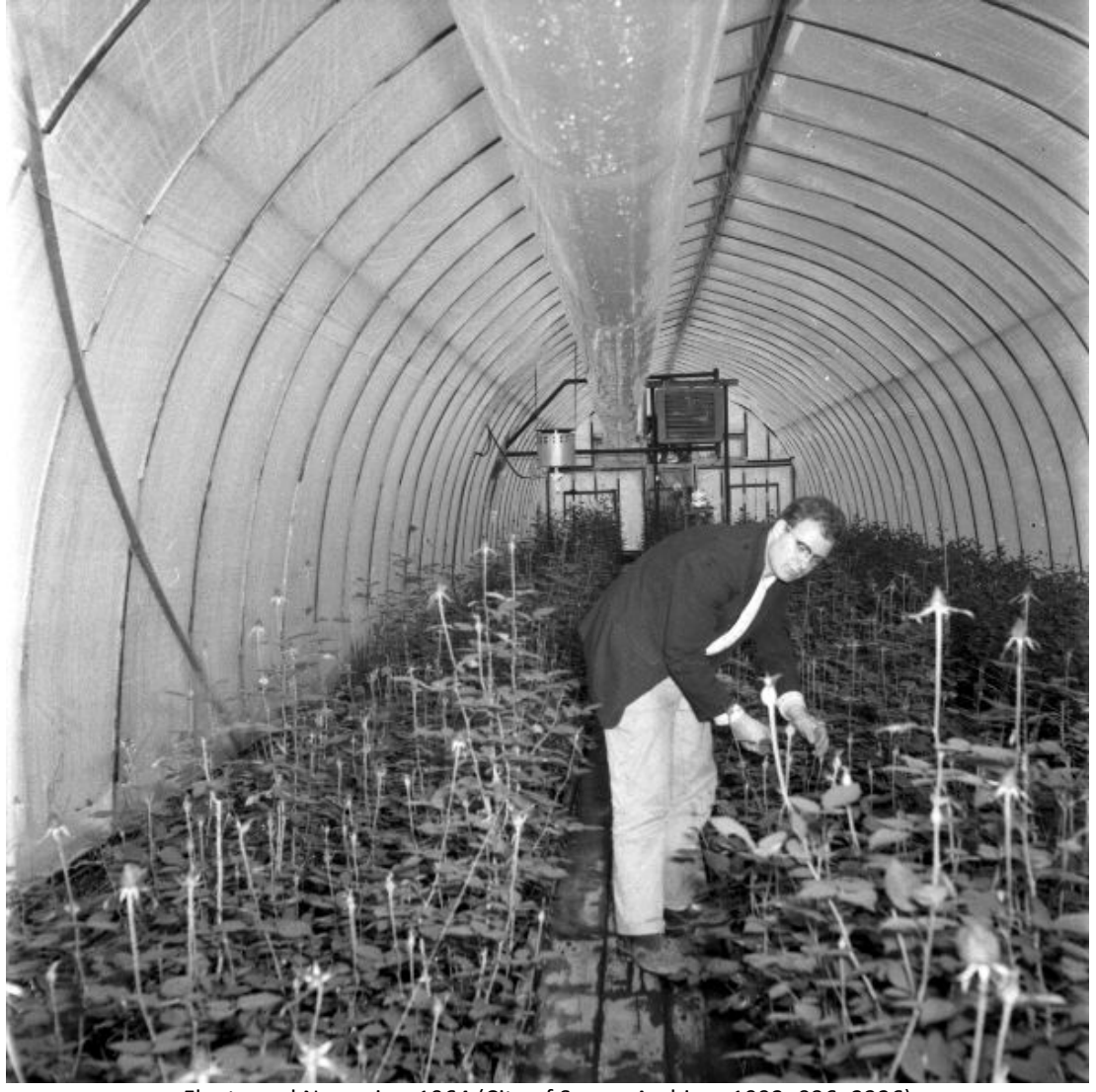
Fleetwood Nurseries, 1964