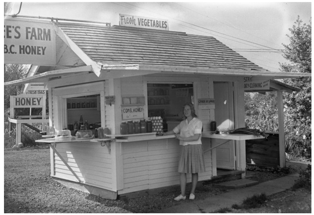
EE's Farm Honey Stand, 1965 (City of Surrey Archives 1992_036_3725)

This Heritage Strategic Review Implementation Plan Update outlines the vision, goals and prioritized strategies for Surrey's Heritage Program. It provides a background of past heritage awareness and planning initiatives, reviews key components of the existing program, defines a vision, goals and strategies for the program, and proposes an Implementation Plan to execute the Strategies and Actions that will help the City realize this renewed vision. This Plan provides a roadmap for the City's conservation initiatives, and is integrated with other civic plans and objectives.