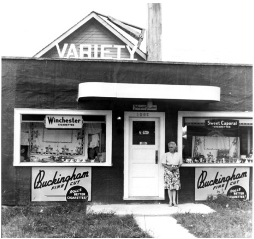
Whalley Variety Store, 1947

DONALD LUXTON & ASSOCIATES INC.: DECEMBER 2016