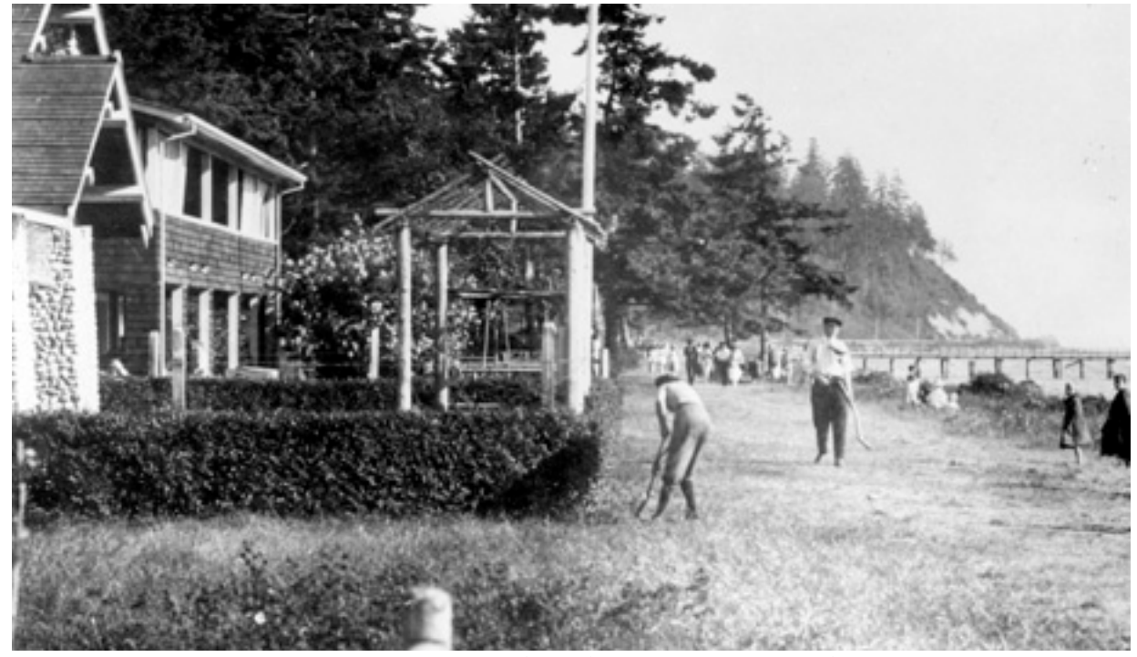
Crescent Beach, 1918

This Heritage Strategic Review Implementation Plan Update provides a renewed vision for Surrey's Heritage Program, in order to enable it to be more effective in conserving, interpreting and celebrating Surrey's heritage.