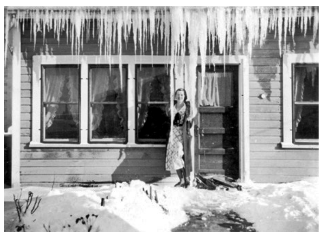
Moore's Café, 1935