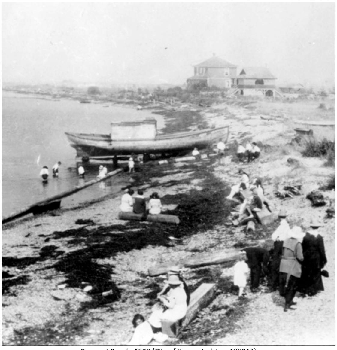
Crescent Beach, 1920