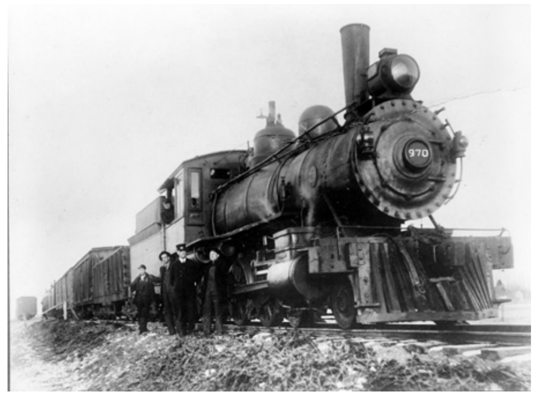
G.N.R. Locomotive in Cloverdale, 1923

The conservation of Surrey's heritage resources supports the development of complete communities and provides long-term benefits to the residents and visitors of Surrey. Enabled by proactive management, community collaboration, incentives, and heritage education and awareness programs, we will conserve and celebrate Surrey's built, cultural and natural heritage. Through community collaboration, we will achieve a broader understanding of our past, it's meaning to the present, and our vision for the future.