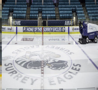
Centre ice / Zamboni ads