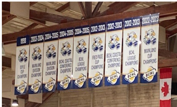
Team banners (East and West ends)