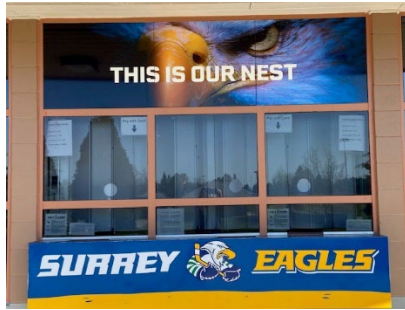
South Arena Entrance