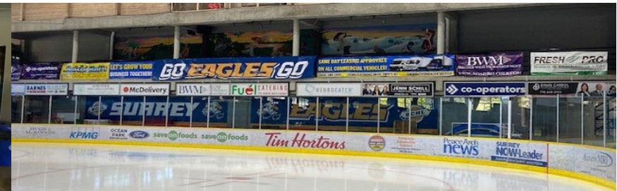
Team banners and banner advertisements (East end)