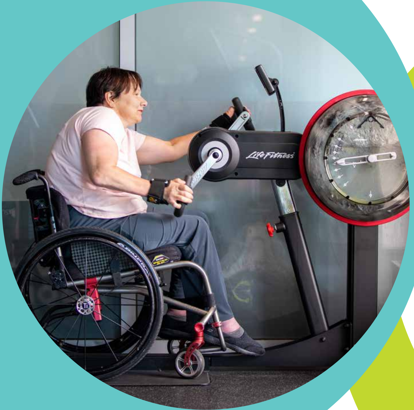
Photo: Surrey Accessibility Leadership Team member at Newton Recreation Centre using the upper cycle ergometer