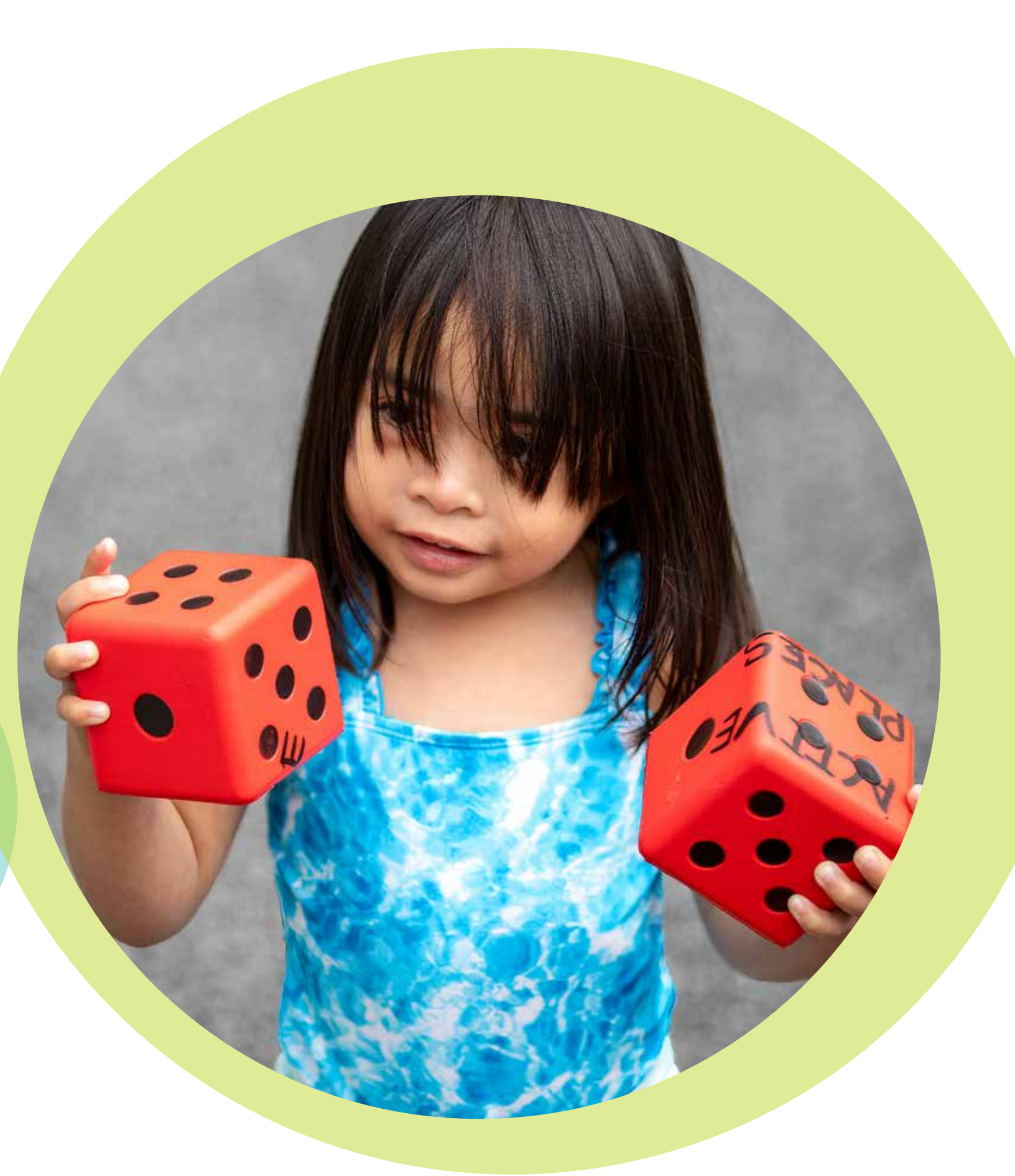
Photo: Child playing at the inclusive playground at Unwin Park