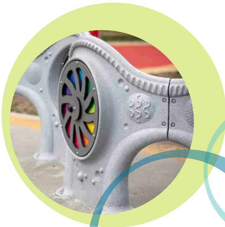
Photo: Inclusive playground at Unwin Park - colour splash sensory play

*41% of online survey respondents self-identified as having lived experiences as defined as having an accessibility need or being a caregiver or therapist of someone with an accessibility need.