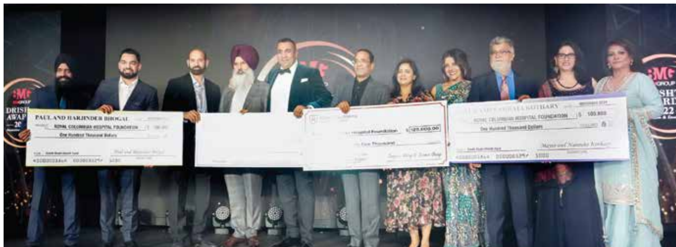
Royal Columbian Hospital Foundation receiving the donation cheques of amount $850,000 from generous donors of South Asian community.