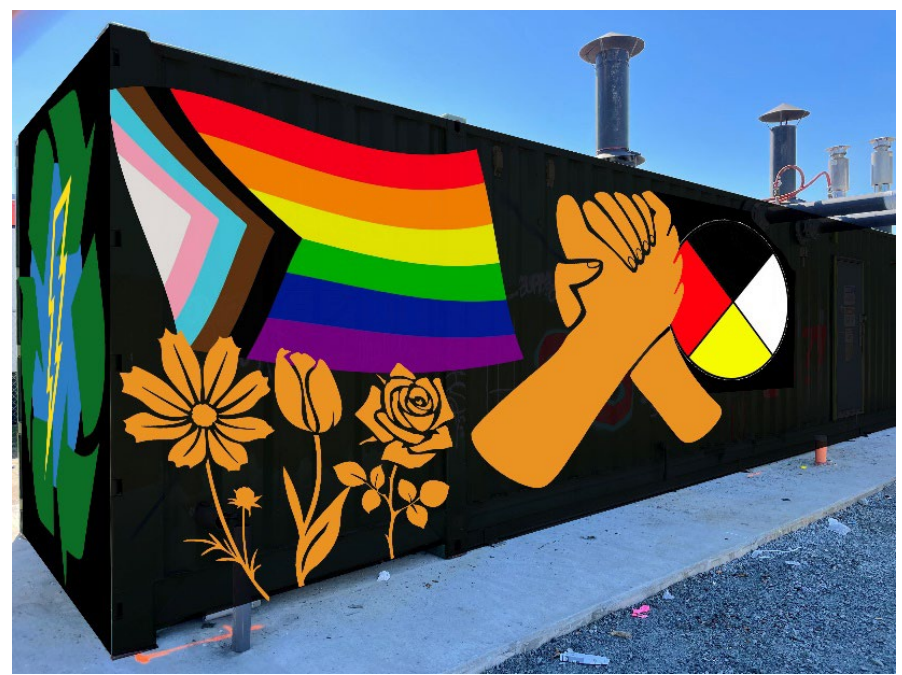
East and North Face