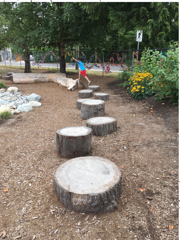
PRECEDENT IMAGE 3 STEPPING LOGS ON END