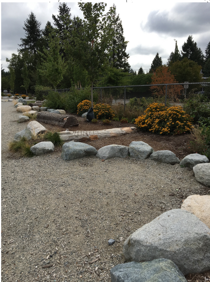
PRECEDENT IMAGE 1 LOG AND BOULDER EDGE