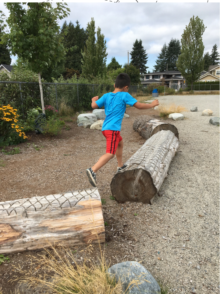
PRECEDENT IMAGE 2 BALANCING LOGS