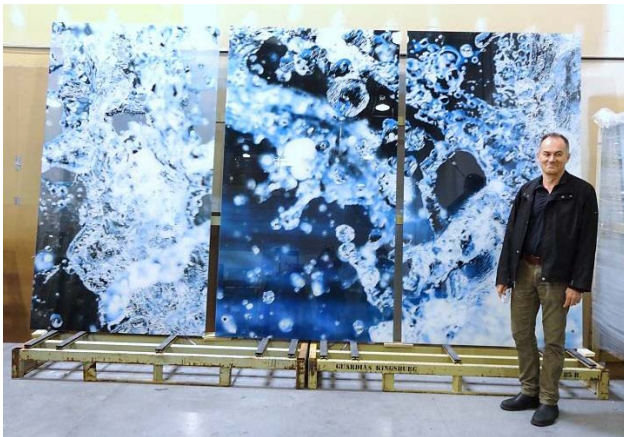
Printed glass panels with artist