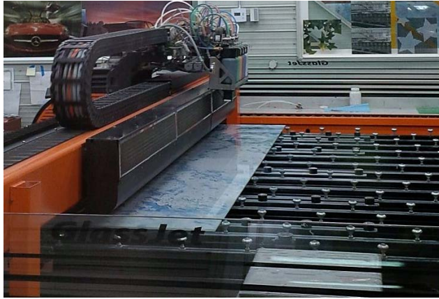
Printing of glass panel at Diamond Sea Glazing