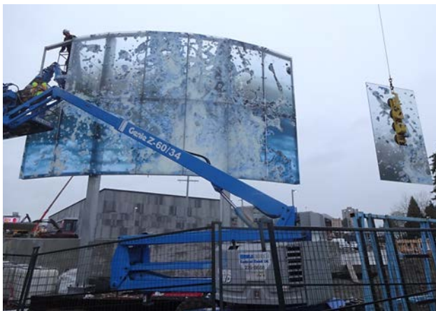
Installation of the last panel of glass