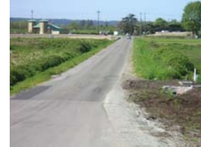
Portion in Agricultural Area

This portion of the corridor (shown as A or in a red-brown colour and identified by green brackets in Figure 1) reflects the agricultural origins by the retention of a rural road standard. It follows both sides of the street beginning at Highway No. 10 at the south. Although the direct connection has been interrupted by Highway No. 10 and the former BC Electric Railway Line, a focal point at this location is proposed to recall the former landing on the Serpentine River. The agricultural character extends to the ridge where Old McLellan Road begins to climb out of the Agricultural Land Reserve and the floodplain area. A proposed linear park at this location crosses Old McLellan Road and will follow the lower ridge, giving pedestrians an opportunity to walk towards the Serpentine River and experience the historic relationship as was experienced at the time of the riverboat activity which was important to the development of this community.