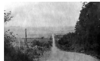
View south along Coast Meridian Road in earlier years would be similar to that for Old McLellan Road