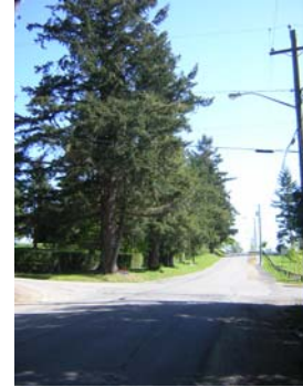
Avenue of Trees

The value of the Old McLellan Corridor rests with it being the historic link from the Serpentine River to Five Corners, and being a diagonal element on a square grid of roads. It was one of Surrey’s first east-west routes. The value also rests with the relationship of buildings to the corridor, the fact that it was the first administrative centre of the City, the natural and cultural landscape of the corridor, its country-like character and the simple engineered road.