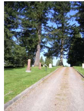
Entrance to cemetery

The existing yards and relationship to the Old McLellan Corridor for buildings along the corridor such as Christ Church are to be preserved. The natural edge is intended to give the pedestrian the impression of buildings and a cemetery located in a forested area, reminiscent of the forests when the area was settled. Complementary landscaping is to be encouraged in the front yards of lots along this side of the corridor.