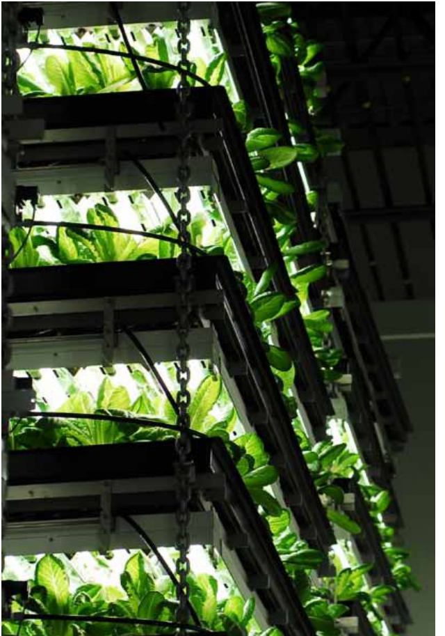
Innovative growing methods can be used to supplement Agricultural Land production.

E3.13 Support programs that help new farmers overcome financial and other barriers to accessing land (includes but is not limited to incubator farms).