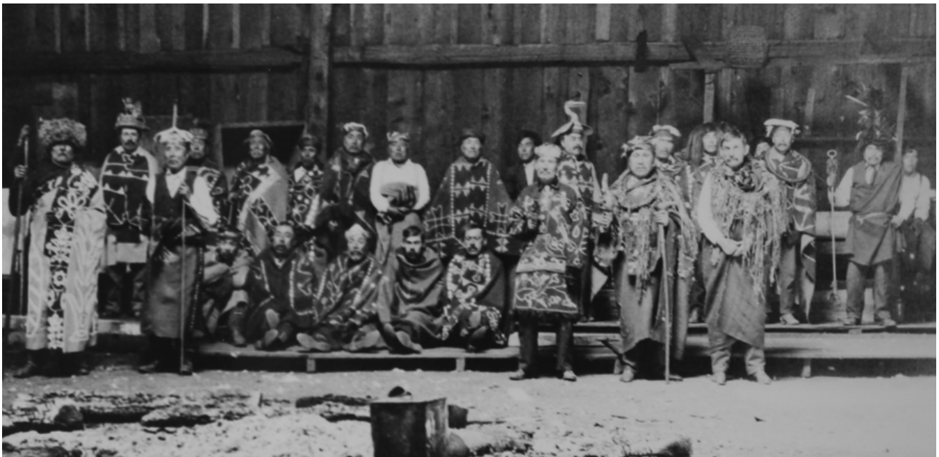
Kwakwaka'wakw chiefs at the McKenna-McBride Royal Commission on Indian Lands (Alert Bay, 1914).