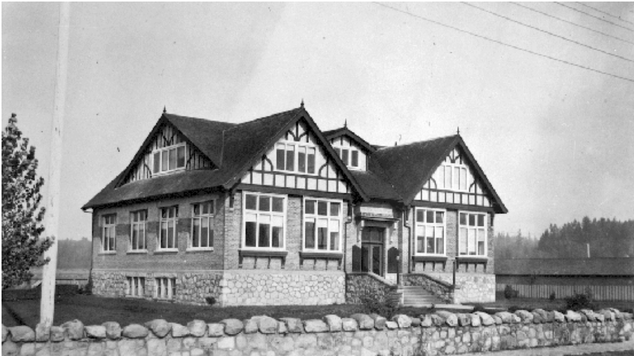
Municipal Hall, 1912

As part of the annual civic budget process, identify budgets for the implementation of Conservation Plans for each site, as well as ongoing maintenance budgets.