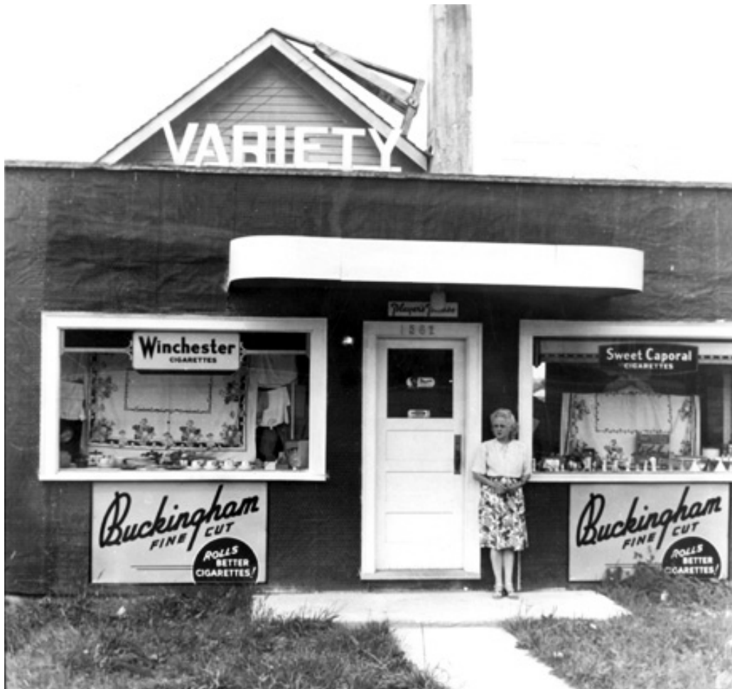
Whalley Variety Store, 1947