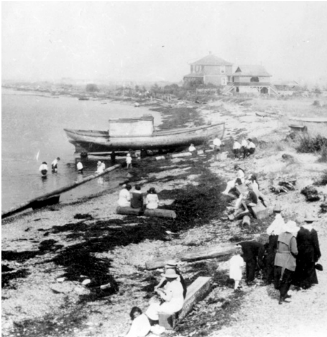
Crescent Beach, 1920