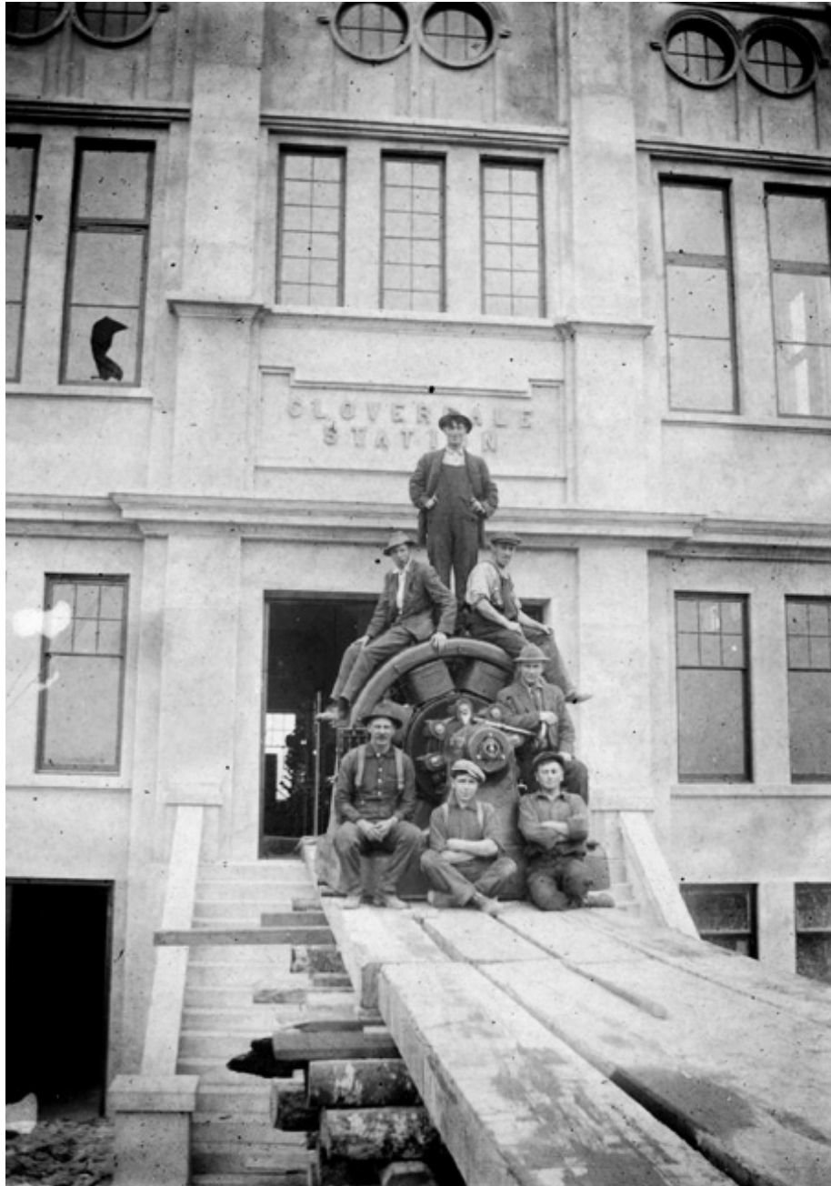
Cloverdale Station, 1912