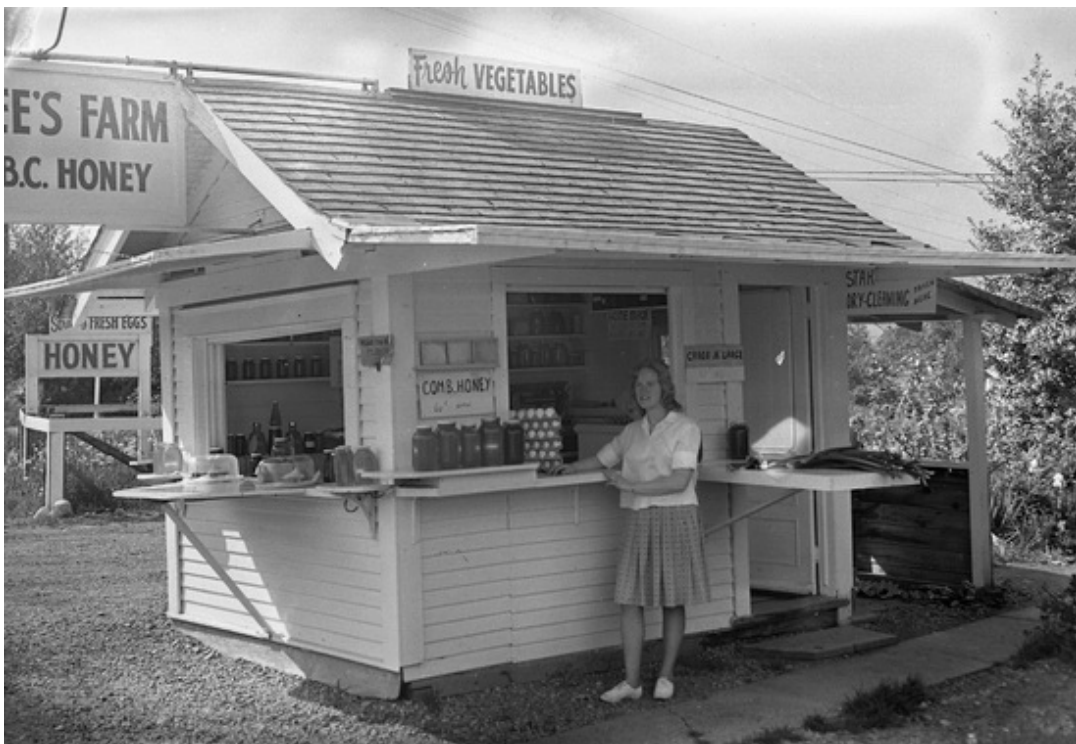
EE's Farm Honey Stand, 1965

This Heritage Strategic Review Implementation Plan Update outlines the vision, goals and prioritized strategies for Surrey's Heritage Program. It provides a background of past heritage awareness and planning initiatives, reviews key components of the existing program, defines a vision, goals and strategies for the program, and proposes an Implementation Plan to execute the Strategies and Actions that will help the City realize this renewed vision. This Plan provides a roadmap for the City's conservation initiatives, and is integrated with other civic plans and objectives.