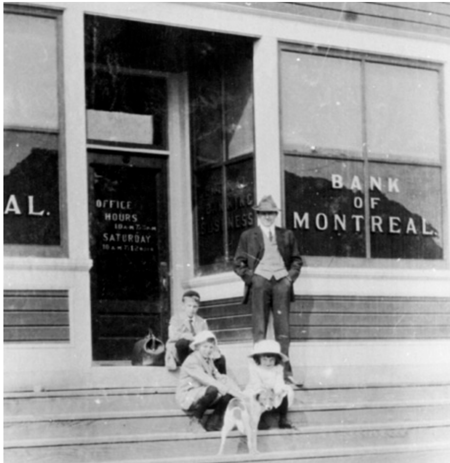
Bank of Montreal, Cloverdale, circa 1910