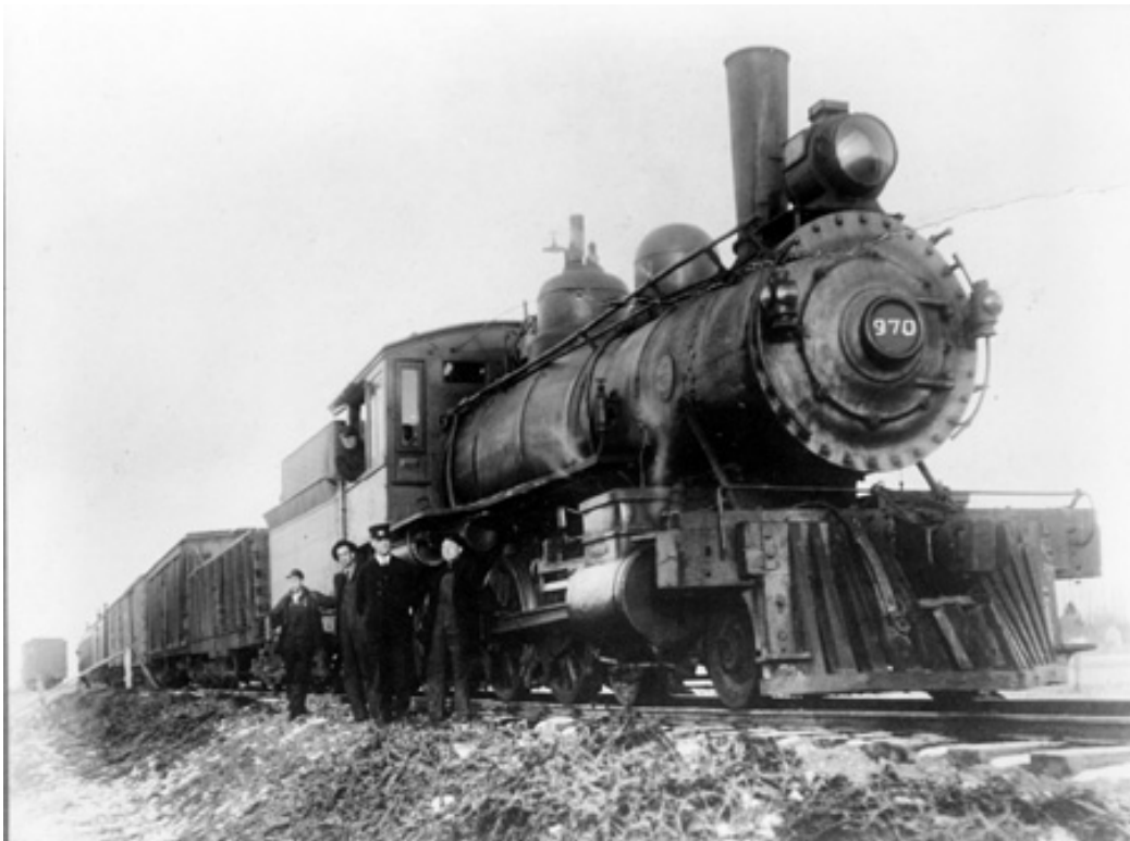
G.N.R. Locomotive in Cloverdale, 1923

The conservation of Surrey's heritage resources supports the development of complete communities and provides long-term benefits to the residents and visitors of Surrey. Enabled by proactive management, community collaboration, incentives, and heritage education and awareness programs, we will conserve and celebrate Surrey's built, cultural and natural heritage. Through community collaboration, we will achieve a broader understanding of our past, its meaning to the present, and our vision for the future.