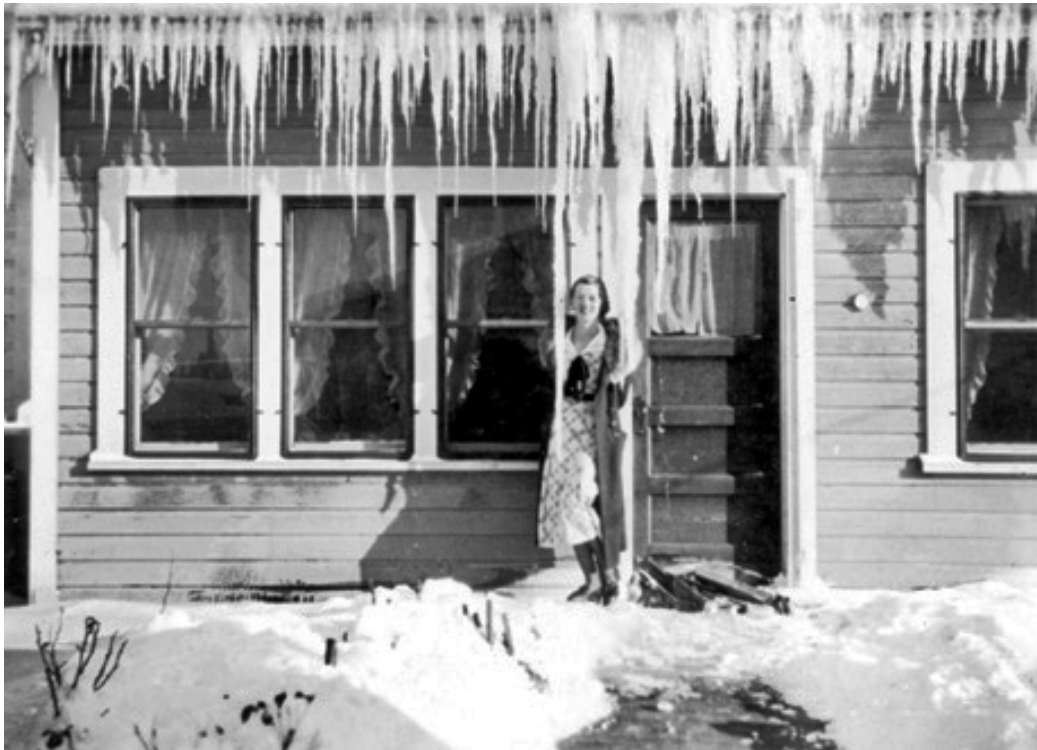
Moore's Café, 1935