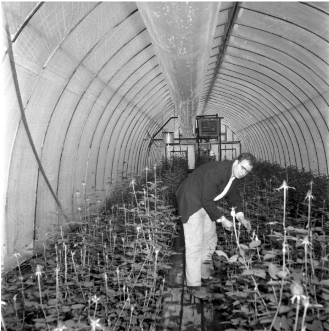
Fleetwood Nurseries, 1964