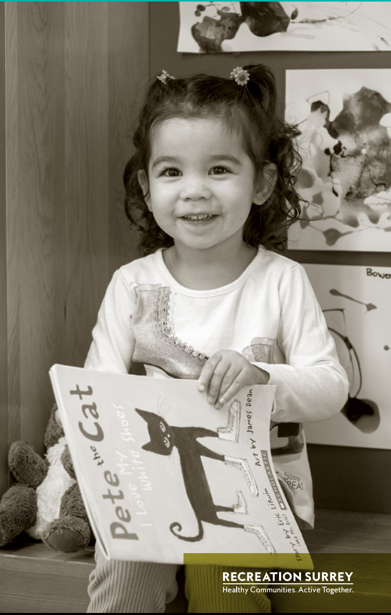
RECREATION SURREY Healthy Communities. Active Together.