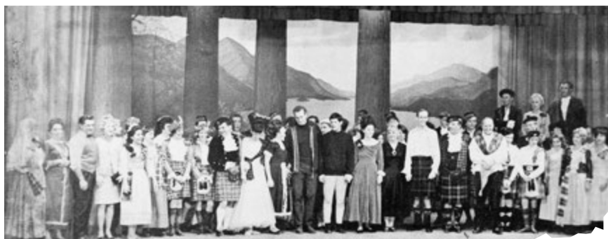
The whole cast of Brigadoon takes a final curtain call following the first night of the production at the new Surrey Centennial Arts Centre and Theatre.