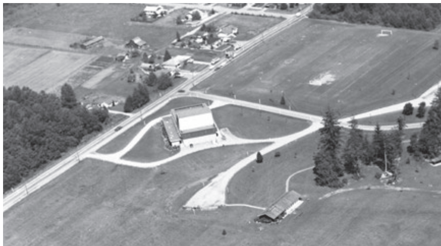
Aerial view of the Bear Creek Park Pavilion, along with the newly constructed Centennial Arts Centre.

Thanks to our good friends at the Surrey Archives, we are able to share some wonderful photos throughout our season brochure of just a few glimpses from 50 memorable years.