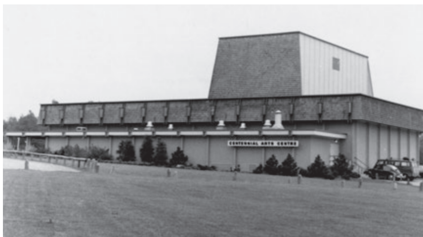
The newly constructed Centennial Arts Centre standing open and ready for visitors in Bear Creek Park.