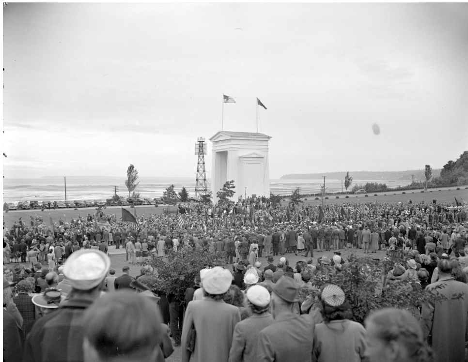
Boundary Treaty Centennial celebration at the Peace Arch border crossing, 1946