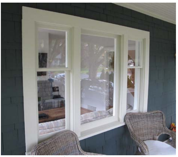
Example: Wood Window on Front Elevation