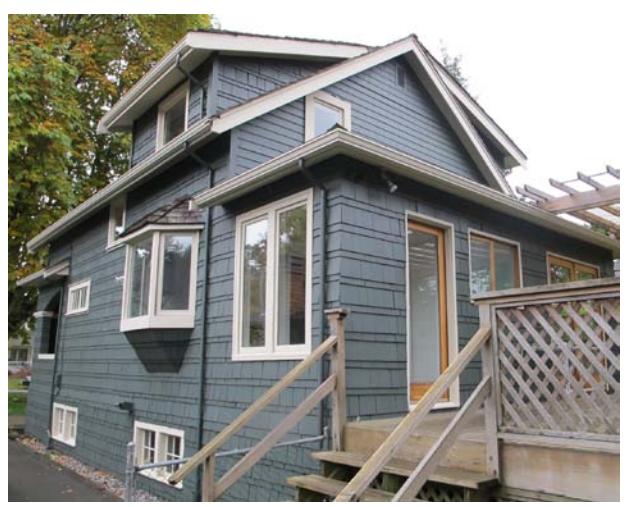
Rear (North) and East Elevations