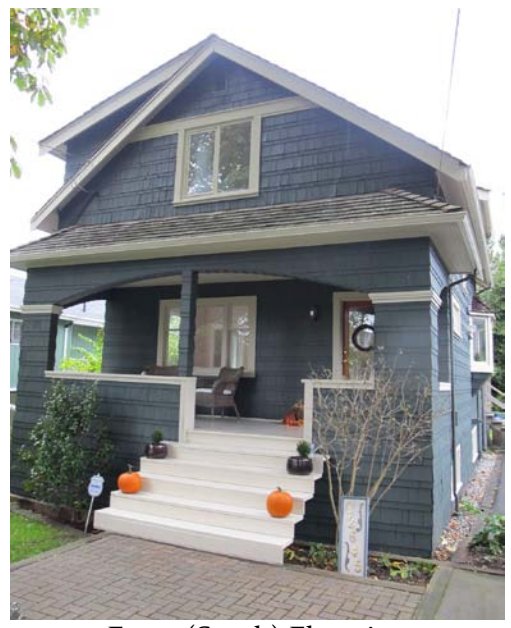
Front (South) Elevation

The following depicts some of the details of the House: