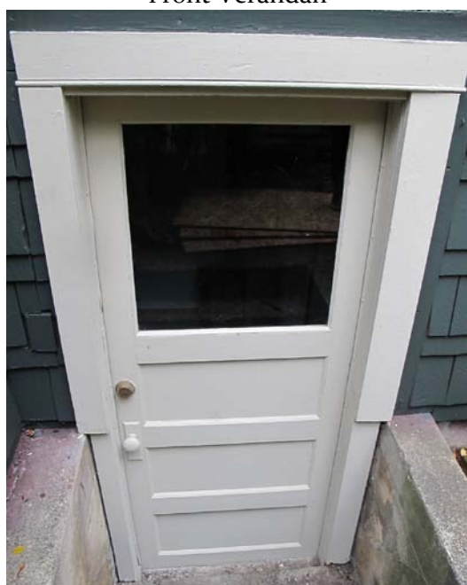
Exterior Basement Door and Hardware