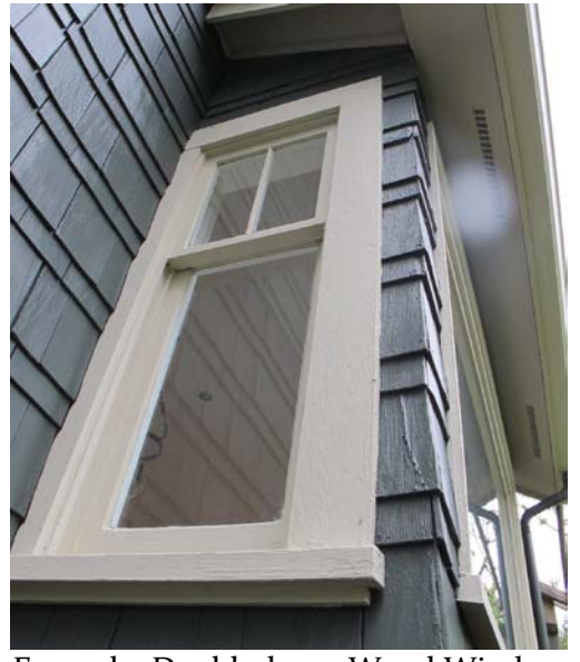
Example: Double-hung Wood Window