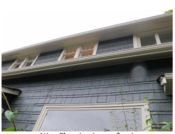
West Elevation (upper floor)