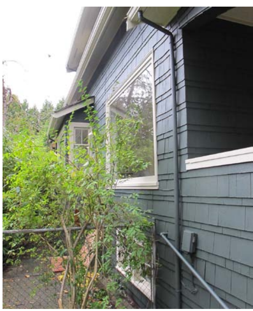
West Elevation (lower floor)