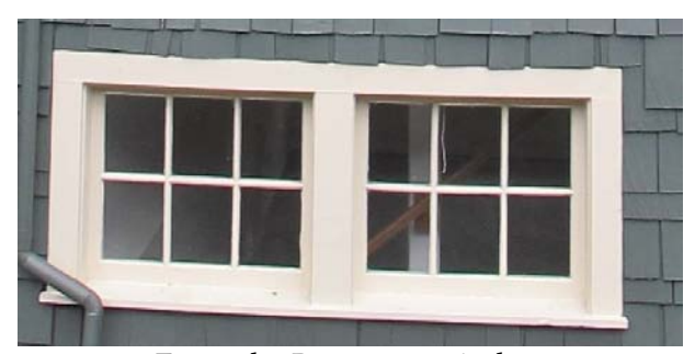
Example: Basement window