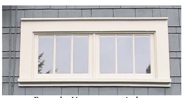
Example: Upper story window